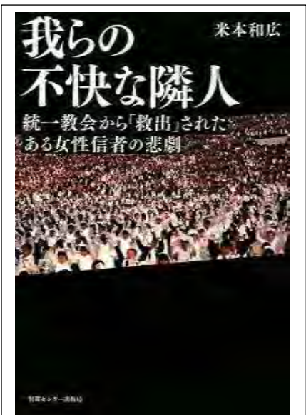
The front cover page of "Our Unpleasant Neighbors: The Tragedy of the 'Rescue' of a Female Believer from the Unification Church " by Kazuhiro Yonemoto (2008)

the National Network of Lawyers Against Spiritual Sales (全国霊感商法対策弁護士連絡会) – also simply known as Zenkoku Benren (全国弁連).