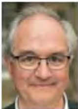
UN Special Rapporteur: Nicolas Levrat.

Through the UN Special Rapporteur [See editor's note below] on freedom of religion or belief at the Human Rights Council, Nazila Ghanea, the UN should be able to lead dialogue with Japan.