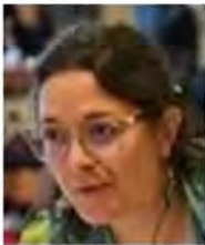
UN Special Rapporteur: Nina Romero.