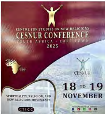
From a CESNUR conference 2025 poster

See part 1: Warning Signal from Japan: Dangerous Precedent See part 3: Regulation as Faith Repression: A Global Trend See also Lobbying Probe Risks Becoming a Witch Hunt