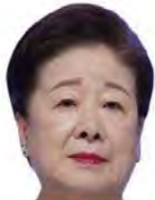
Hak Ja Han, also called Mother Han or Holy Mother Han.

What is striking is that the detention came while she was medically vulnerable: she had recently undergone heart surgery in early September 2025 and is reported to suffer from impaired eyesight and diabetes. Her detention in the context of fragile health is not a mere legal act – it is a warning. It signals that leadership of a minority faith can be targeted, not just membership. When affiliation or leadership becomes a liability, freedom is at risk.