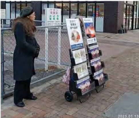
Belonging to a persecuted religious minority in Japan: A female believer at a street display for Jehovah’s Witnesses in Naha City, Okinawa, Japan 13th January 2025. Photo: Naha Mama Pavilion. Public domain image. Cropped

Their concerns included discriminatory school-materials that portray religion as potential child-abuse, the misuse of the “public welfare” doctrine to justify broad restrictions, and the risk that religious minorities are penalised under vague legal standards. Japan was urged to revise its Q&A Guidelines, to cooperate fully with UN mechanisms, and to restore institutional equality for religious organisations under the law. ( Jehovah’s Witnesses in Japan )