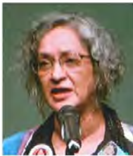
UN Special Rapporteur: Farida Shaheed. Photo (2016): Wotancito / Wikimedia Commons. License: CC ASA 4.0 Int. Cropped

On 1 st October 2025, four United Nations Special Rapporteurs [See editor's note 1 below] issued a joint statement from Geneva expressing “serious concern over Japan’s continued stigmatization of religious minorities.” The experts are: Nazila Ghanea – Special Rapporteur on freedom of religion or belief; Nicolas Levrat – Special Rapporteur on minority issues; Gina Romero – Special Rapporteur on the rights to freedom of peaceful assembly and association; and Farida Shaheed – Special Rapporteur on the right to education. ( OHCHR )