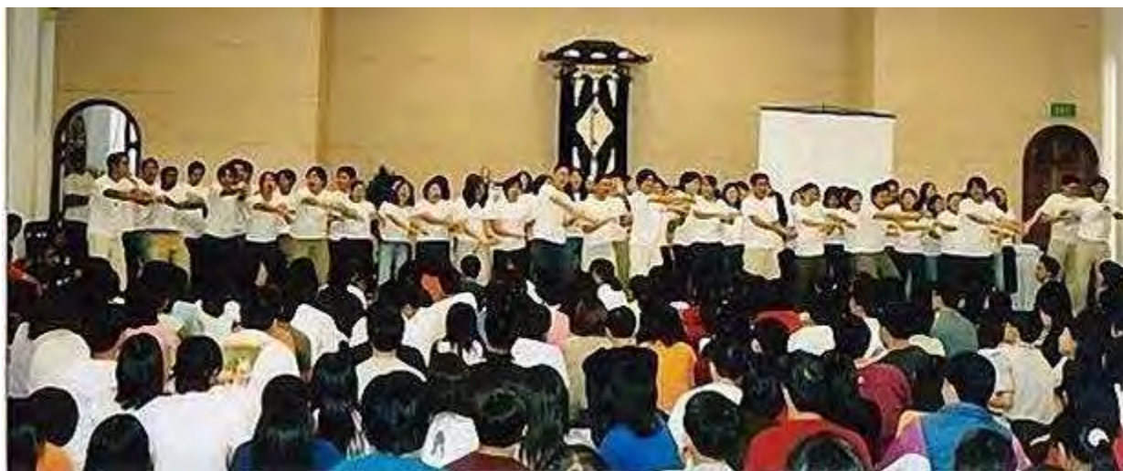
Also subject to faith-breaking attempts: Members of Soka Gakkai. Here students belonging to the faith in 2001

professional faith-breakers (deprogrammers) or organizations hostile to new religious movements (NRMs). This phenomenon often targets members of such movements, e.g. relatively large faiths like the Family Federation or Jehovah's Witnesses, but also smaller groups like Happy Science (Kōfuku no Kagaku) and other newer religious movements.