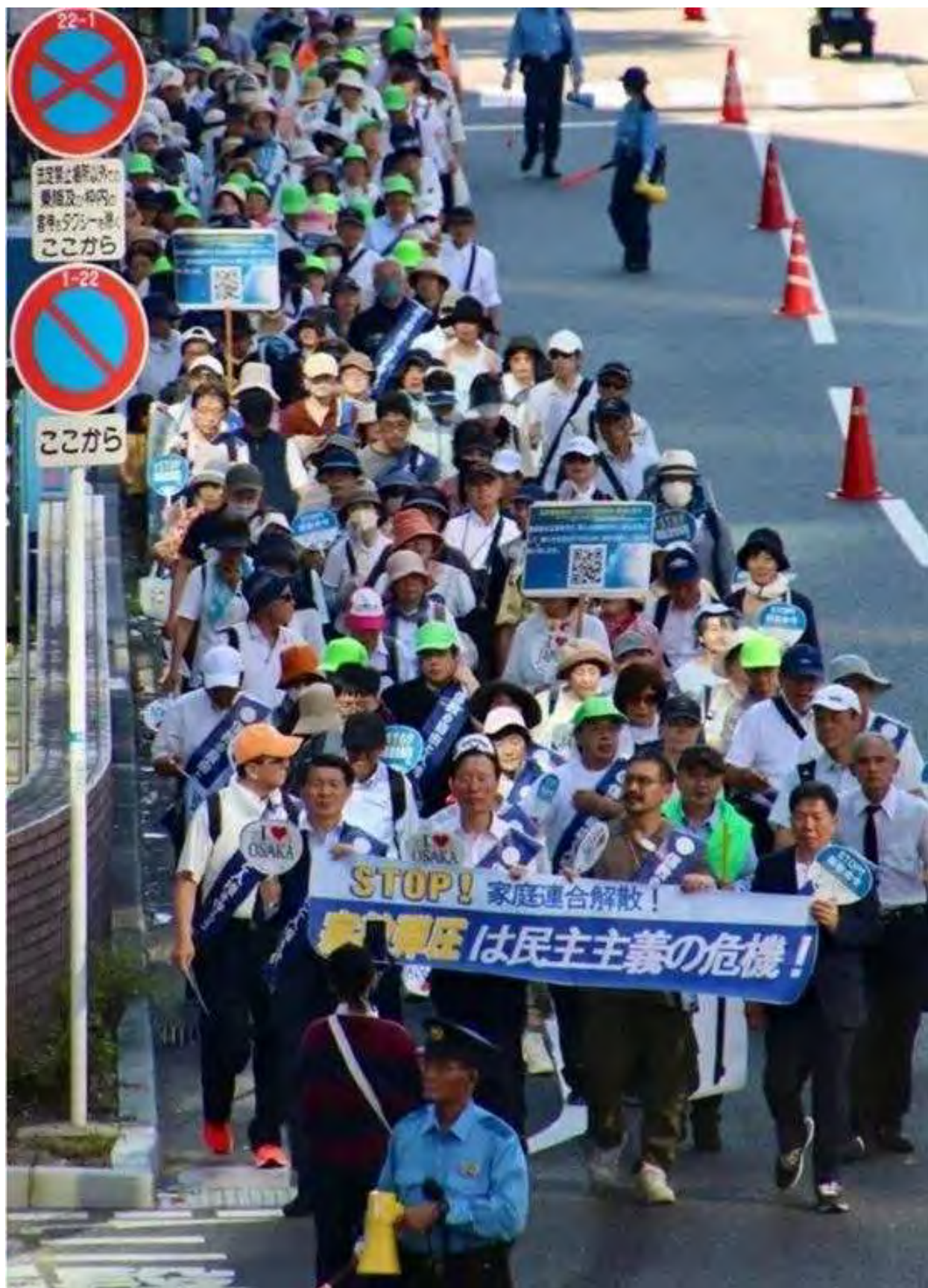
Family Federation members marching in the demonstration - August 31, 2025, Kita Ward, Osaka, Japan

"The reports are full of opinions from former members pushing for the dissolution of the religious organization , while the voices of current believers are not reflected at all."