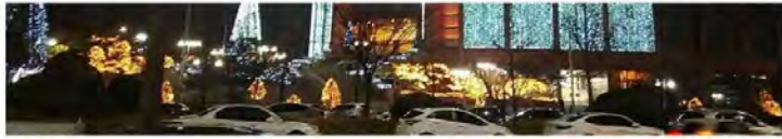
Another religious organization being raided in South Korea: Yoido Full Gospel Church , here 4th Dec. 2016.

Pompeo's remarks deserve particular attention. As America's top diplomat under Donald Trump, he was a vocal advocate of religious freedom worldwide, often linking it to democratic resilience and human dignity. His concern that South Korea's treatment of Dr. Han may constitute an "attack on religious freedom" situates the case in a broader international conversation. It is not merely a domestic legal matter but one with potential implications for South Korea's reputation as a democratic state committed to universal rights.