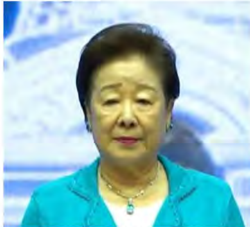
Hak Ja Han, Holy Mother Han, here in Gapyeong, South Korea 20th July 2025.

The immediate issue is the special prosecutor's request for Dr. Han (82) to appear for questioning in connection with the so-called "Geonjin Monk- Family Federation lobbying scandal". Allegations center on the claim that gifts, including luxury items, were delivered to former First Lady Kim Kun-hee (김건희) by an intermediary