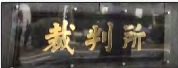
Sign outside the building housing Tokyo District Court and Tokyo High Court.

rejected the plaintiff's claims in full, ruling that Suzuki's remarks did not constitute defamation.