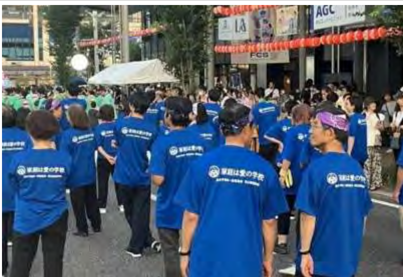
Members of the Kōriyama Family Church participating in the Uneme Festival, August 9, 2025, Kōriyama City, Fukushima Prefecture, Japan