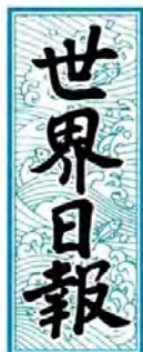
Logo of the

Lower court's defamation decision overturned by judges siding with anti-cult journalist using abusive language against victim of dehumanizing faith-breaking confinement lasting more than 12 years