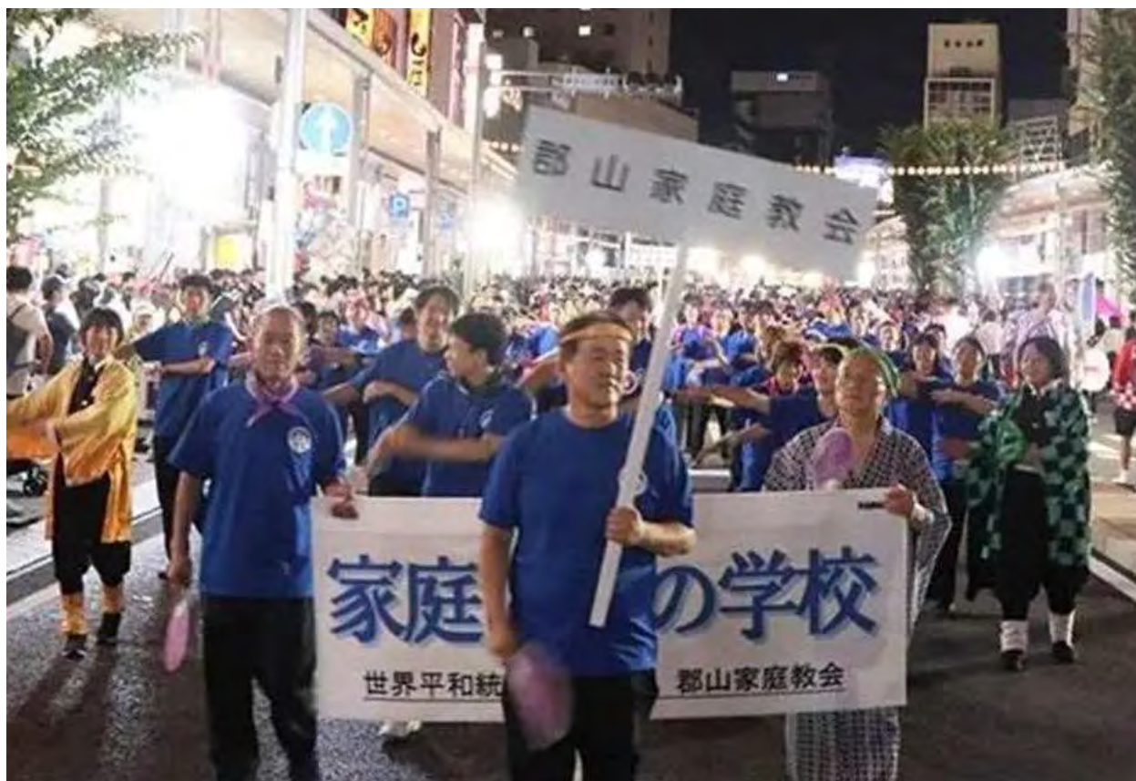
Members of the Kōriyama Family Church participating in the Uneme Festival, August 9, 2025, Kōriyama City, Fukushima Prefecture, Japan