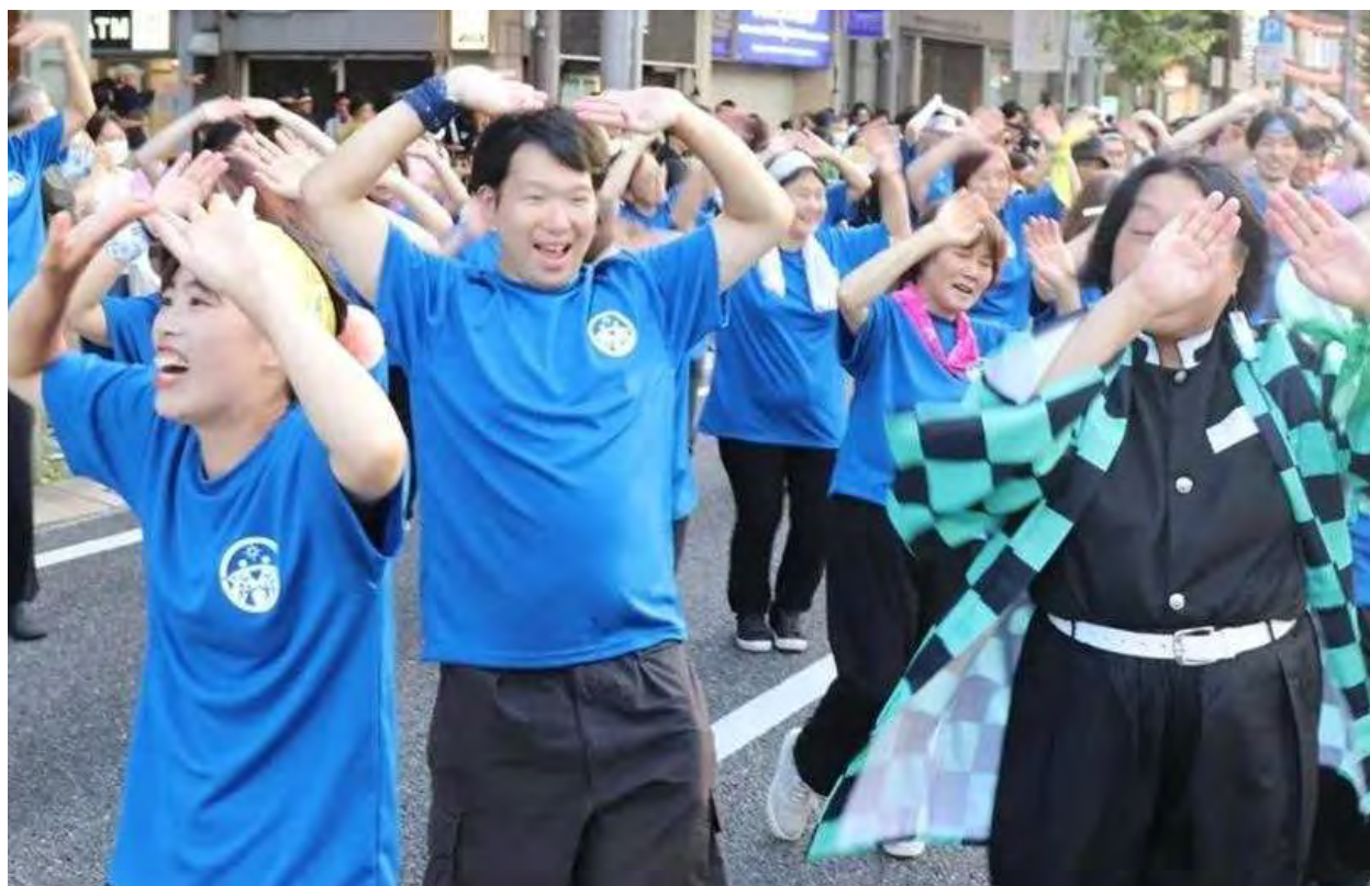
Members of the Kōriyama Family Church participating in the Uneme Festival, August 9, 2025, Kōriyama City, Fukushima Prefecture, Japan

Therefore, the committee judged there was "no reason to refuse participation".