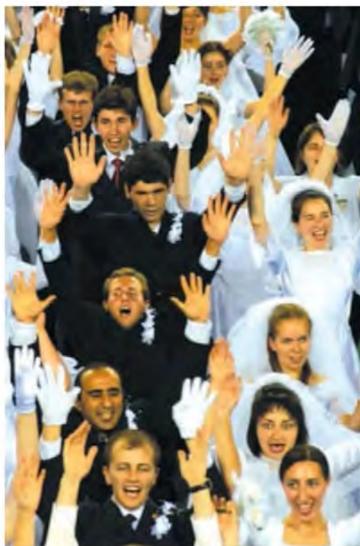
Some of the couples 13th July 2003 in Cheonan.

forward demonstrated by this ceremony is like a bright beacon of glorious light that will lead us to a world of peace and contentment and so fulfill the prophecies of all the great prophets.