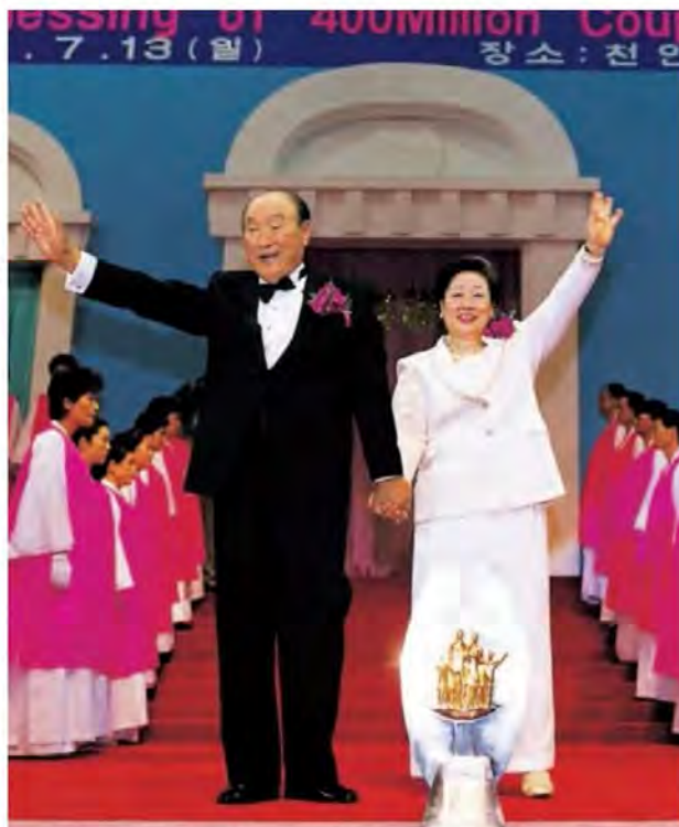
Father and Mother Moon 13th July 2003.

In his benediction prayer, Father Moon said,