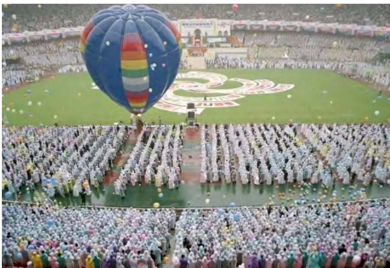
August 25, 1995 was a wet day in Seoul. Here, some of the couples with raincoat

The large number of couples who participated created significant practical challenges in many countries when it came to gathering the couples and blessing everyone simultaneously regardless of location. In Africa and in some countries of the former Soviet Union, the ceremony therefore had to be held at different times in many places.