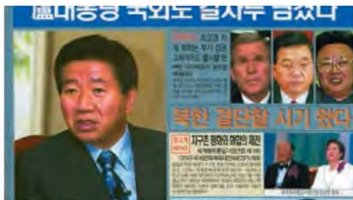
From the front page of August 2003 issue of Korean magazine Shisa News Monthly.

“The event showed how Rev. Moon actualized the unity of all different peoples through racial and religious