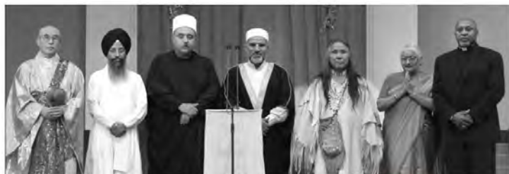
Religious leaders in Cheonan 13th July 2003.

The event showed the scope of the activities in which FFWPU has been involved, including those that aim to overcome the problems caused by sexual promiscuity and crises of sexual identity, which are threatening to families, nations and, moreover, world peace.”