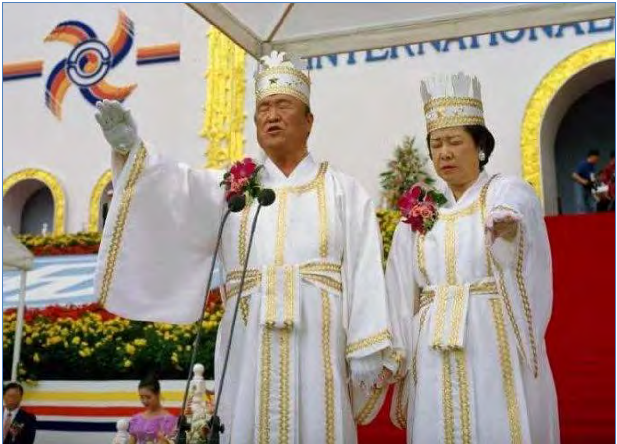
Father Moon and Mother Han praying for all the couples in Seoul's Olympic Stadium August 25, 1995

August 25, 1995 in Seoul's Olympic Stadium: Marking three decades since South Korea hosted one of the largest marriage blessings in history