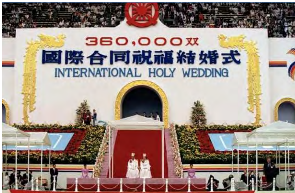
The stage with Father Moon and Mother Han August 25, 1995

The main event in the Blessing of all these couples from around the world took place in Seoul. Beginning with this Blessing event, a much larger proportion of the couples were already married beforehand and thus had their existing marriages blessed , rather than young unmarried people being matched and then receiving the Blessing .