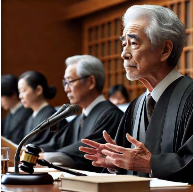
Japanese judges using "reasonable inference" in order to dissolve religious minority organization even though there was no evidence for it

court remained silent on this matter. Likewise, the court ignored the fact that many of the Ministry's witnesses had undergone abduction, confinement, and forced renunciation of faith, with testimonies dating back decades.