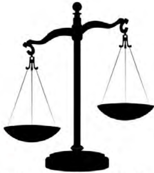
Imbalanced scale of justice in dissolution case as solid claims by Family Federation were not recognized. Photo: 991joseph / Wikimedia Commons. Public domain image

"If it were only about freedom of thought, that might be true. However, freedom of religion also includes the right to preach and hold gatherings."