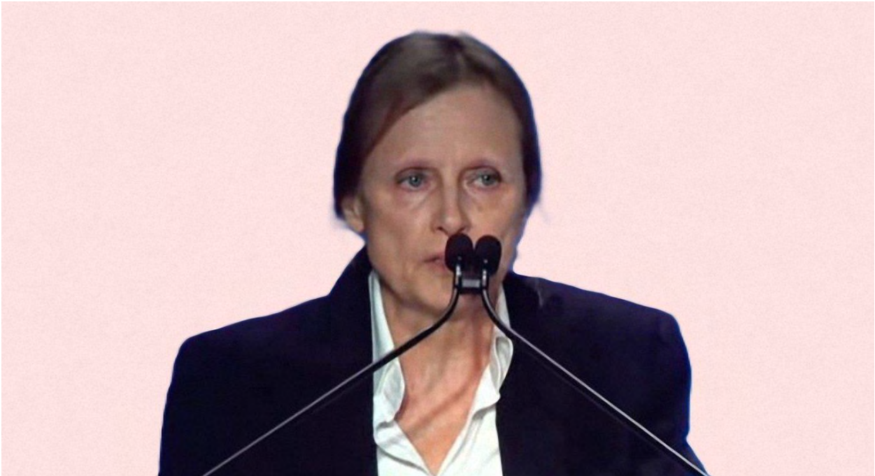
Patricia Duval, French attorney and expert on international human rights law. She has defended the rights of minorities of religion or belief in domestic and international fora, and before international institutions such as the European Court of Human Rights, the Council of Europe, the Organization for Security and Co-operation in Europe, the European Union, and the United Nations. She has also published numerous scholarly articles on freedom of religion or belief. Here, speaking at the International Religious Freedom Summit in Washington DC February 5, 2025