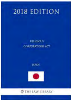
Front page of 2018 English version of Religious Corporations Act of Japan.

Expert: Legal Flaws in Dissolution Order Case