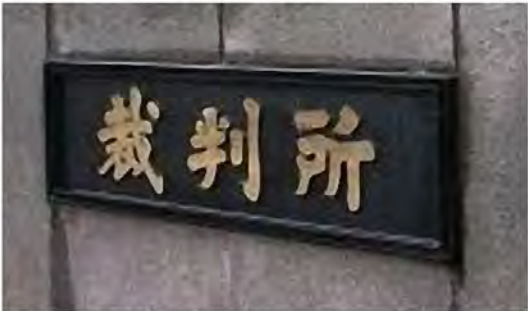
The sign outside Tokyo District Court.

Given this, the Tokyo District Court, upon receiving the dissolution request, should have explicitly acknowledged the right to seek judicial review in a proper trial before issuing the dissolution order. Likewise, the former