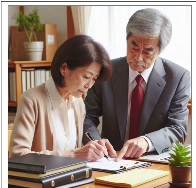
Japanese government official getting woman to sign document containing evidence tampering

The Sankei Shimbun, one of Japan's five largest national newspapers by circulation, revealed in an article on 25th February 2025, details of a controversy that involves the Family Federation for World Peace and Unification , formerly known as the Unification Church . A dispute has arisen over a closed-door hearing at the Tokyo District Court regarding the petition from the Ministry of Education, Culture, Sports, Science and Technology (MEXT) to dissolve the religious organization that is relatively large in Japan, with its 600,000 members.