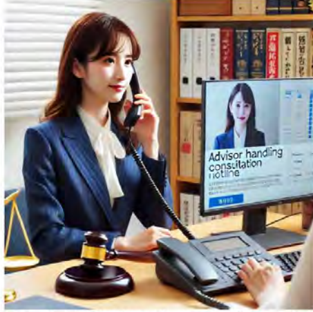
Consultation hotline. Illustration: Microsoft Designer Image Creator , 16th January 2025

Symbol of the Ministry of Education, Culture, Sports, Science and Technology of Japan. Photo: 文部科学省 (MEXT Japan) / Wikimedia Commons . License: CC Attr 4.0 Int