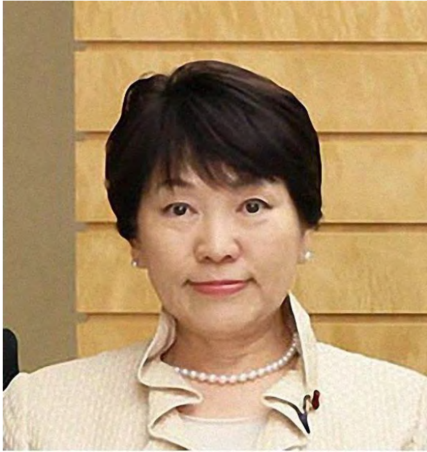
Toshiko Abe, Minister of Education, Culture, Sports, Science and Technology (MEXT) 2023