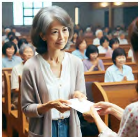
Japanese woman offering a donation at a Sunday worship service.

On 11 th July last year, the Supreme Court ruled that the statement affirming no refund claim was invalid. The case was as follows: