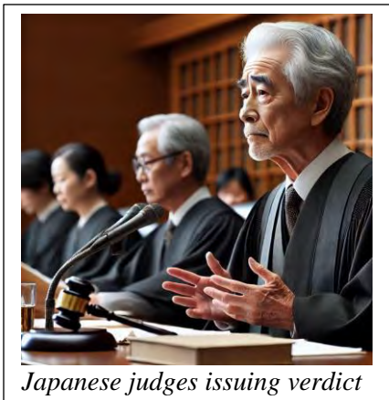
Japanese judges issuing verdict

However, in the case of the Family Federation , a compliance declaration was made in 2009, and since then, civil disputes have significantly decreased. Therefore, a dissolution request based on civil