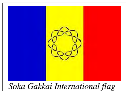
Soka Gakkai International flag

[Editor's note 1: A non-contentious case refers to a legal matter where there is no dispute between parties. These cases typically involve administrative, procedural, or uncontested legal actions, such as probate (handling a deceased person's estate), uncontested divorces, adoption, or registering a trademark. Since there are no opposing parties or legal conflicts, these cases usually proceed smoothly through the legal system without litigation.]