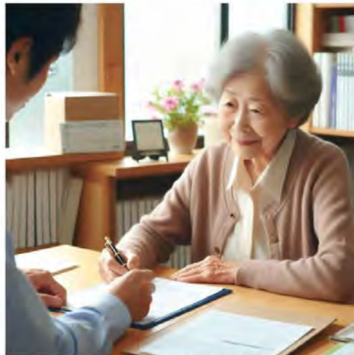
Elderly Japanese woman getting a memorandum at at notary office.

Q: Some elderly Family Federation believers have written memorandums affirming that they do not seek a refund of their donations. Among their children, some are believers while others oppose the faith. In one lawsuit seeking a refund filed by those who opposed the faith, the Family Federation won in both the first and second trials, but after the parent's death, the Supreme Court remanded the case to the High Court in July of last year. This case is expected to have repercussions for many religious organizations beyond the Family Federation.