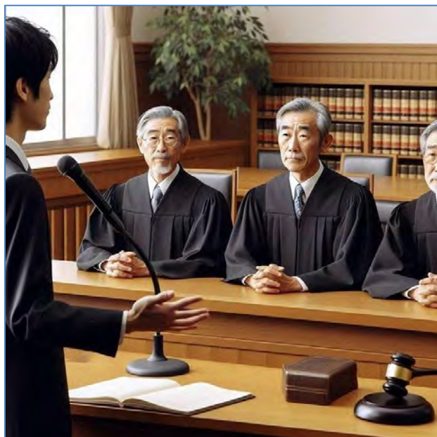
Japanese lawyer presenting a case with legal flaws in court