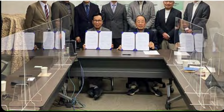
The Zenkoku Benren and the Korean Heresy Countermeasures Association

March 2025 — Tokyo A Tokyo court orders the dissolution of the Unification Church.