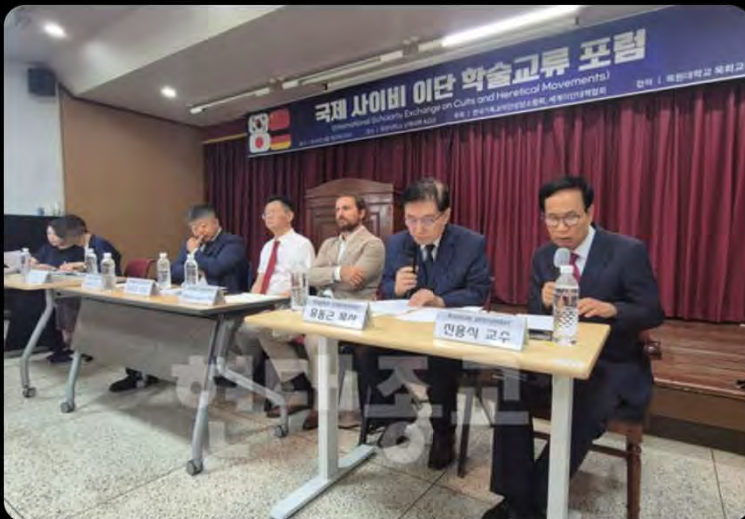
International Forum for the Study and Exchange on Cults and Heresy in Korea

August 2025 — South Korea An anti-cult seminar is held at Mokwon University in Daejeon. Experts from China, Japan, South Korea, and Germany gather to discuss groups including the Unification Church and the Church of Almighty God. A representative of the Hubei Provincial Anti-Cult Association — a CCP-affiliated body — presents alongside Korean and Japanese academics.