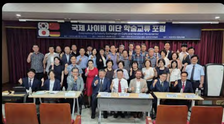
International Forum for the Study and Exchange on Cults and Heresy in Korea

To understand the picture, meet three groups operating in three countries — all working under the banner of "anti-cult" activism.