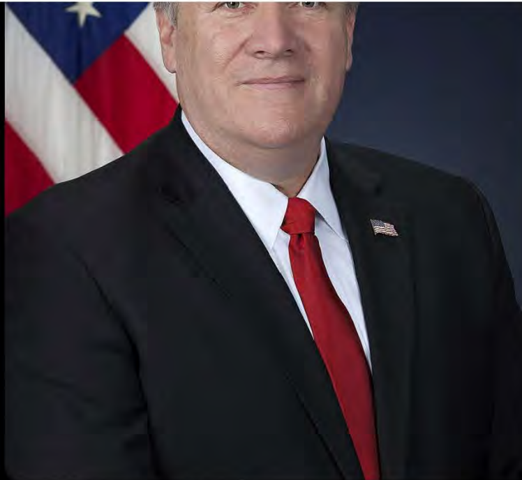
Former U.S. Secretary of State Mike Pompeo

Pompeo also noted the strategic significance of the Unification Church: the Family Federation has long supported strong alliances between the U.S., Japan, and South Korea — the very partnerships Beijing seeks to weaken. In Pompeo's assessment, "the only entity that benefits from weakening the Family Federation is communism."