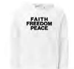
FAITH FREEDOM PEACE HOODIE