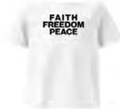
FAITH FREEDOM PEACE T-SHIRT