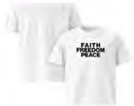
FAITH FREEDOM PEACE RELEASETHEMOTHEROFPEACE