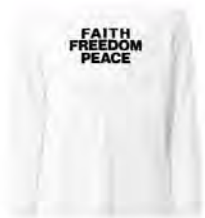
FAITH FREEDOM PEACE LONG SLEEVE