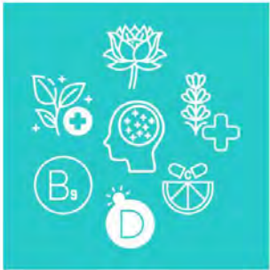
Researchers Review Non-Prescription Options for...