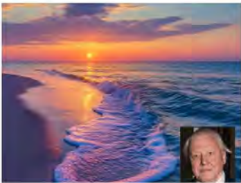
The Eco-Evolution of Famed Naturalist David Attenborough