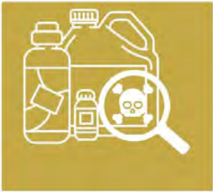
Researchers Identify 4,200+ 'Chemicals of Concern' in Plastics