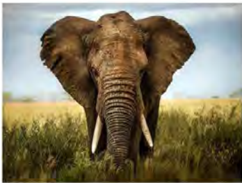
Silence After the Roar: Humanity's Lonely Planet