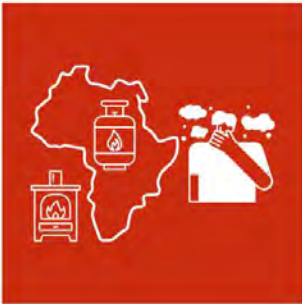
Universal Access to Clean Cooking in Africa