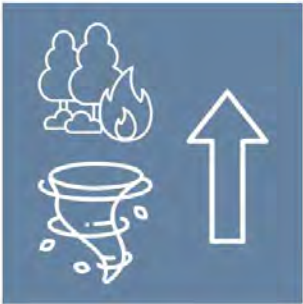
Billion-Dollar US Natural Disasters