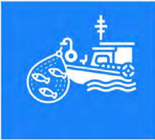
UN Global Fisheries Report 2025