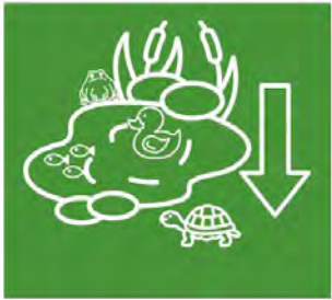
Global Wetlands Area Shrinking Annually