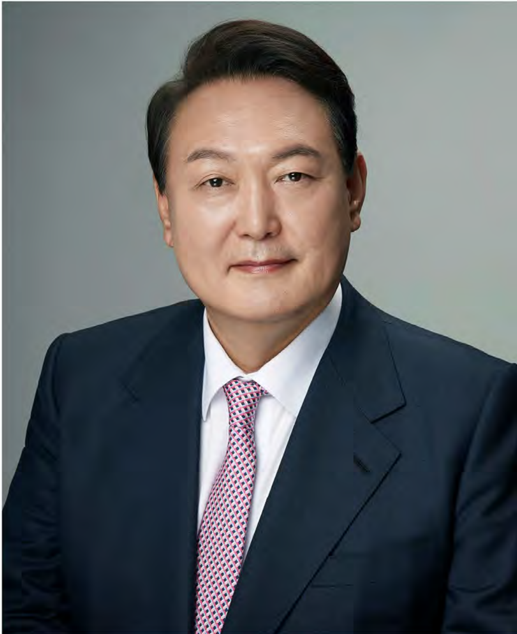
Disgraced former Korean President Yoon Suk Yeol.

What is happening in Korea raises serious religious liberty concerns. Both the Yoido Church and the Family Federation have complained that the raids have been unnecessarily harsh and spectacular, as if they were primarily conducted for the benefit of the media, showing little respect for their sacred places and internationally well-known religious leaders. They are both asking for apologies from the prosecutors for their total disregard for the sanctity of church sanctuaries.