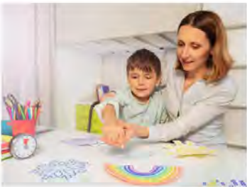
From Genetics to the Environment—Risk Factors for Autism