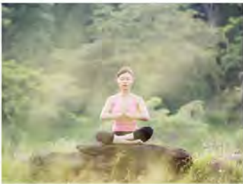
Spiritual Groups Nurture Sacred Bonds with Nature