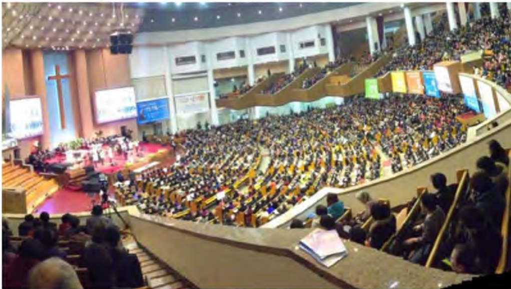
A Sunday service at Yoido's Full Gospel Church.

As the case of the Yoido Church demonstrates, the movement to punish religious groups that did support or were suspected of supporting Yoon now targets all brands of religion perceived as conservative, pro-American, and defending traditional family values.