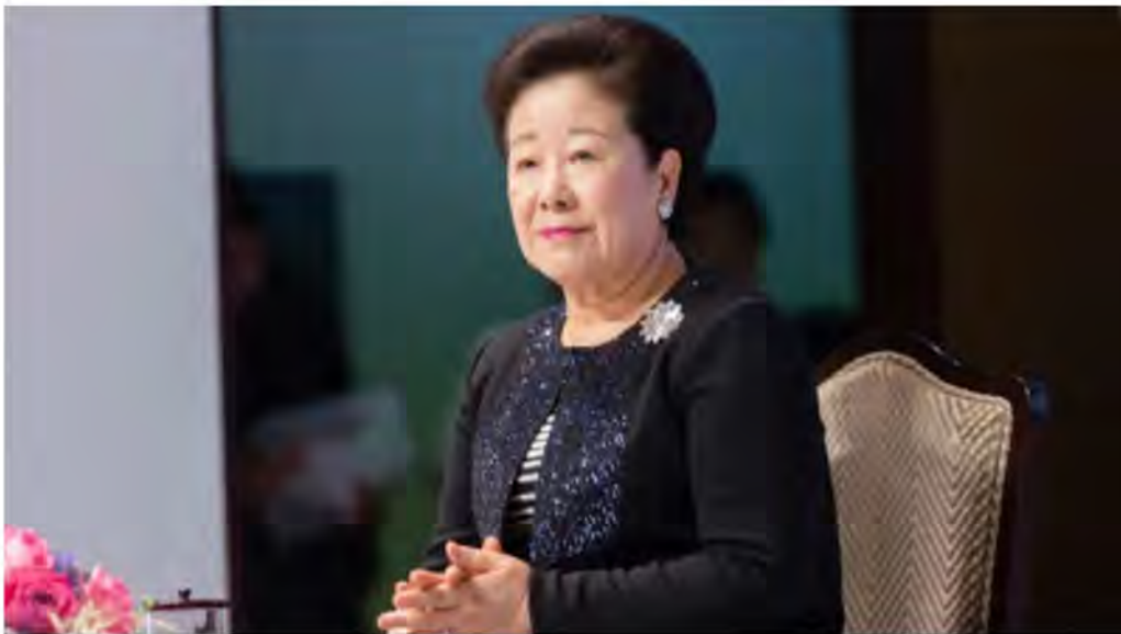
Dr. Hak Ja Han Moon.

On August 25, 2025, the day of the White House visit of South Korean President Lee Jae-myung, Donald Trump decried the "vicious raids on churches" in Lee's country. What happened, exactly?