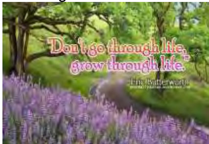
Second Blessing - True Parents

seek our original homeland and build the Kingdom of God on earth and in heaven, the original ideal of creation, by centering on true love.