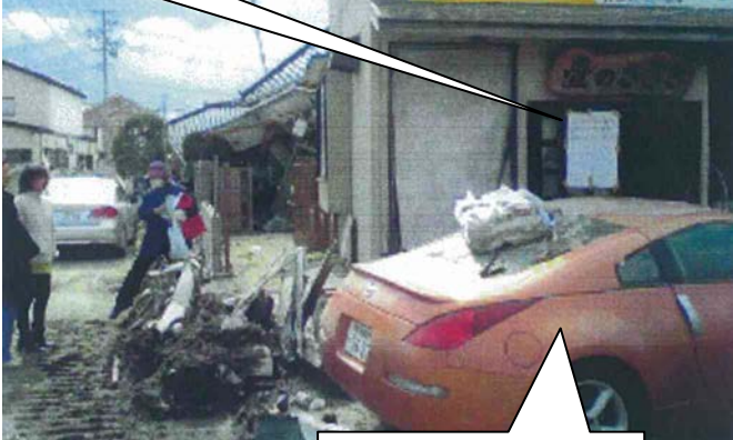
Someone's car carried by tsunami