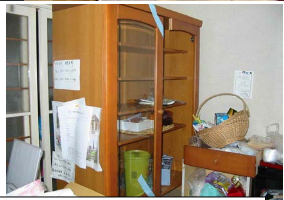
Kitchen: cupboard is no longer in use