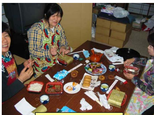
...and had a break.