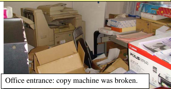
Office entrance: copy machine was broken.

4 members cleaned and organized the storage area, office entrance, kitchen and lavatory. In order to encourage a new start, they threw away many old documents and equipments. That refreshed the office nicely.