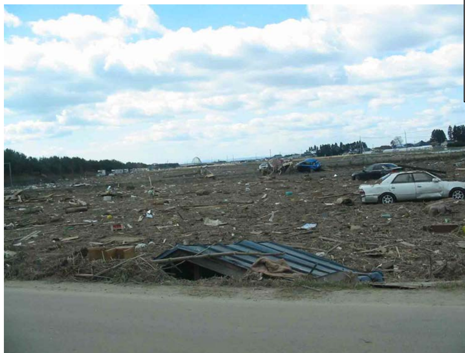
Roadside Scenery in Wakabayashi-ward, Sendai