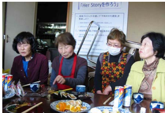
Members of WFWP Miyagi chapter

Miyagi office will move to the lower floor in near future.