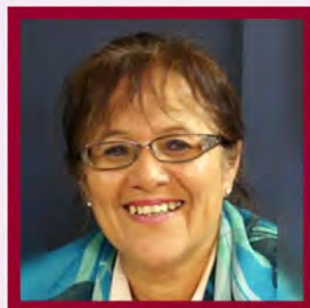
Grandparents' Contribution to the Well-being and the stability of the Family Apr 27, 2022