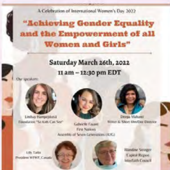
WFWP CANADA Celebrates IWD 2022 May 2, 2022

Women should be encouraged to play a leading role in transcending barriers of race, nationality, religion and cultures to facilitate global peace. "