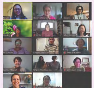
WFWP-Canada Holds its First Virtual Retreat Feb 2, 2021