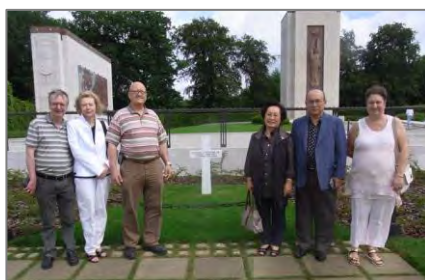
At the grave of General Patton at the Luxembourg American Cemetery