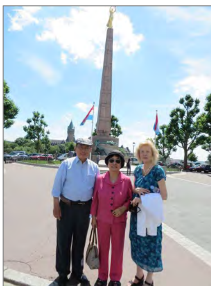
In front of the Gëlle Fra (Golden Lady) War Memorial