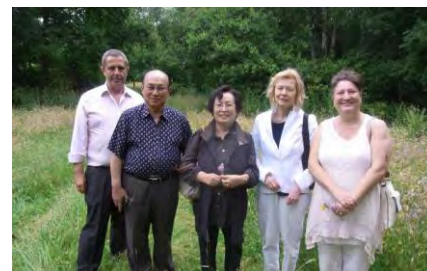
Near the Holy Ground established in Luxembourg on 9 th August 1965