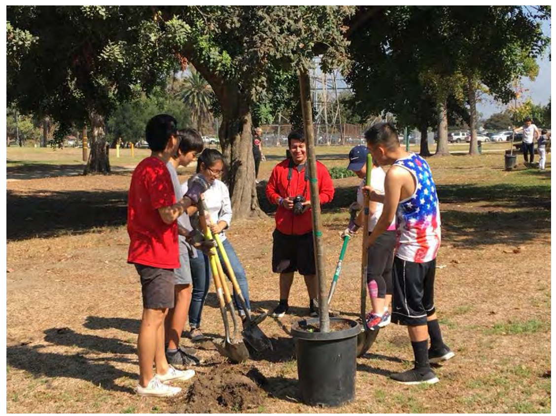
CARP PCC plants trees on a Saturday for community service.

And a new chapter was officially registered as a student club on campus , joining the movement of young people changing the conversation on campus.