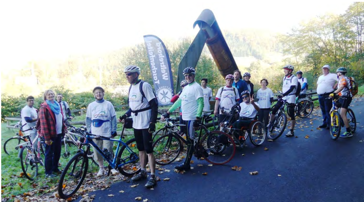
Here in front of the biggest jackknife of the world!