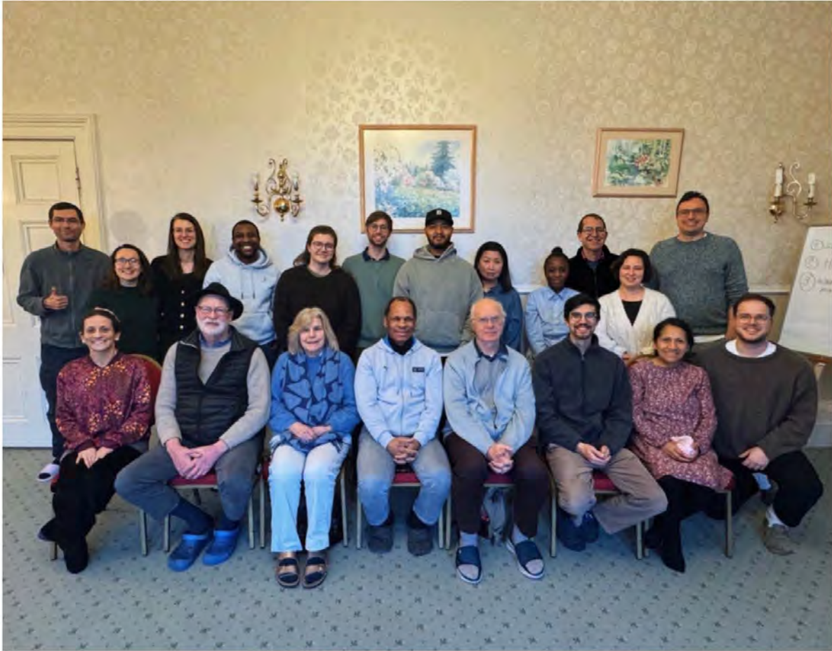
COMMS TEAM UK

February 20, 2026 | Activities, Articles | Events, HQ, Livingstone House, Ministry Forward