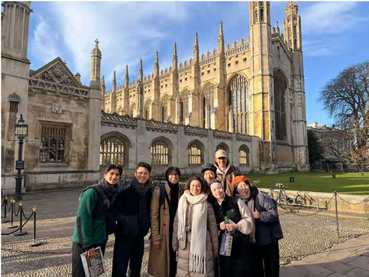
COMMS TEAM UK

February 20, 2026 | Announcements, Articles | CARP, Greenwich CARP, River South, Young Adults, Youth