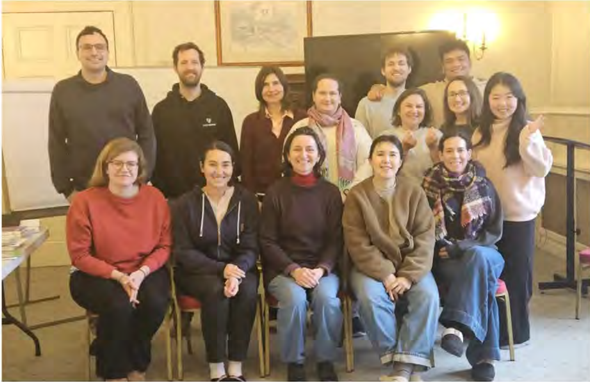
COMMS TEAM UK

February 20, 2026 | Activities, Announcements | Children's Ministry, Events, Livingstone House, Workshop