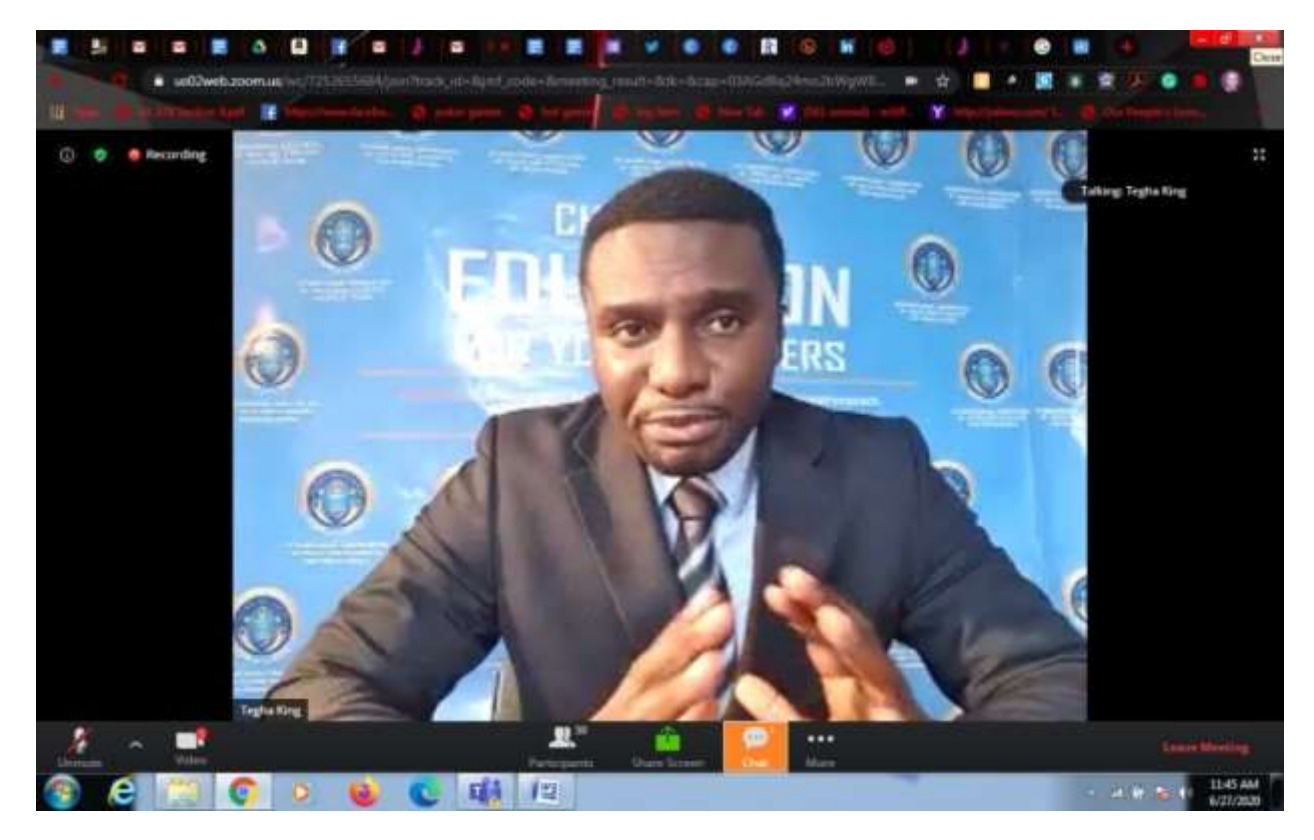
About 20 Youth leaders and teachers followed the program on big screens and 45 others took the course using the smart phones and Laptops.

The Workshop was directed towards raising the trainers who will head Character Education Clubs and Programs in Ghana. It is believed that the efforts will go a long way to safeguard the peace Ghana has enjoyed since the beginning of the Fourth Republic; that it will be a catalyst for peace during this election year. IAYSP Ghana through this Webinar reached out to the Police Sector of the nation and requested to become a stakeholder in National Peace-building programs.