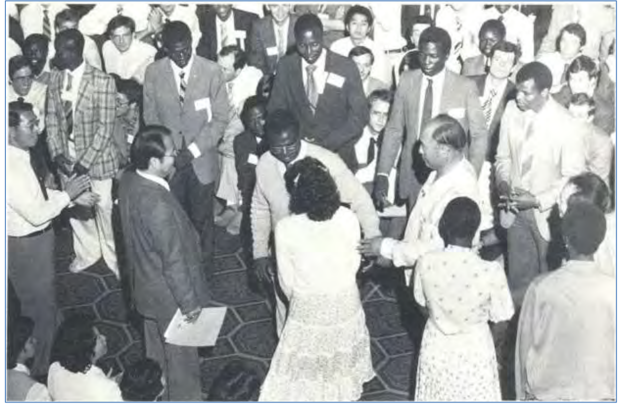
Blessing candidates from mission countries at the matching with Father in 1982 in Seoul, Korea.

One great spiritual battle the missionaries faced was to overcome resentment and the tendency to blame God and True Parents for their suffering, their loneliness, and their not being able to love the nation, the people, their fellow missionaries, or often even themselves.