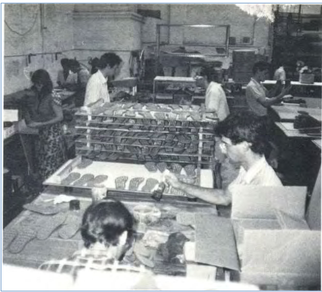
Greenvilla, Australia 1984. Production team manufactures shoes, from cutting soles to the final packaging.

With such an array of black and yellow, brown and white, black and brown, and black and white couples, one could see that the colors of humankind have finally begun to meld together. Many blessed babies from these unions have already been born. And God's dream of one global family of humankind has become much more a reality.