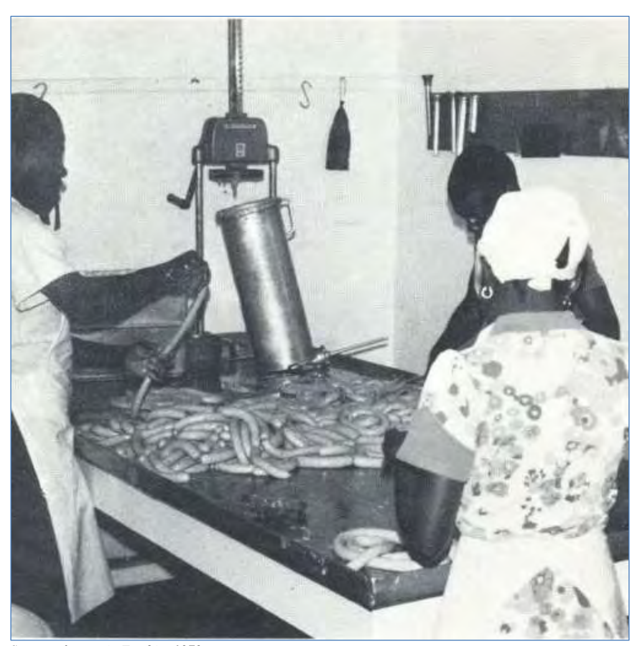
Sausage factory in Zambia, 1979

Just as the missionaries have friendships with many of the professors and scholars from ICUS, PWPA, and IRF, some of our correspondents are in contact with fellow journalists who have attended the World Media Conferences.