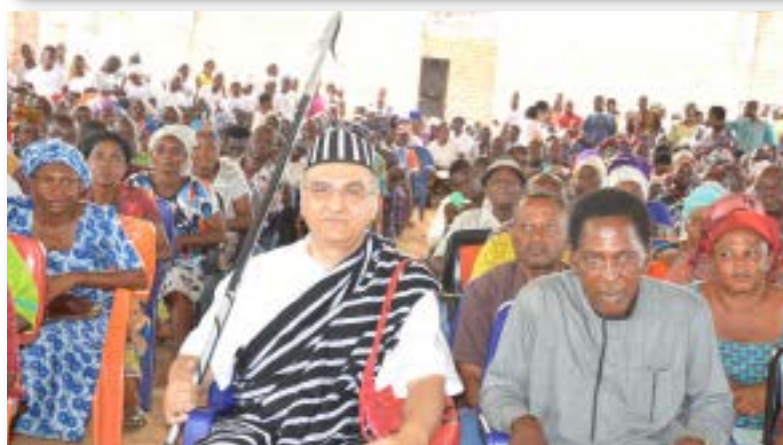
With the minister of the church who studied and likes DP: