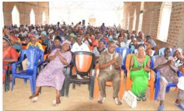
The church of Buruku.