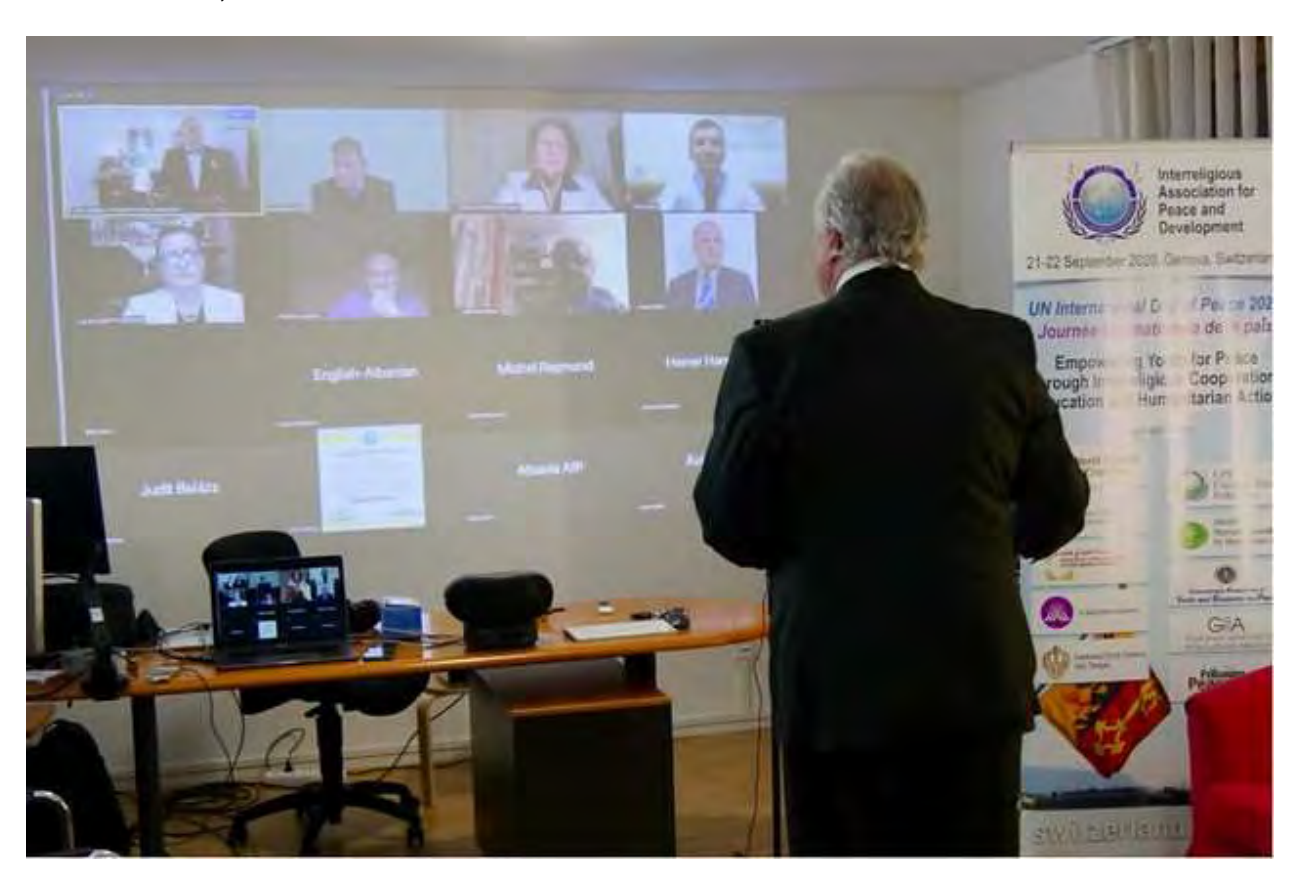
Geneva, Switzerland -- An Albanian Peace Council of Albanians living in Switzerland received its inauguration.

Chantal Chetelat Komagata December 18, 2021