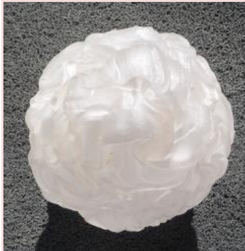
Lamp Top View

Here is a top view of the lamp and again you can see the amazing pattern formed into the glass!