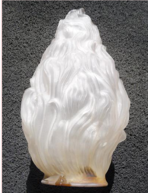
Lamp Side View

acid washed and then painted with a gold power coat that will make them look great for years! The glass Lampshades are a different story. They are the largest lampshades around measuring 17" tall about 9" across the widest part and with a 5" fitter (collar). The pattern on the glass is simply beautiful as shown below.