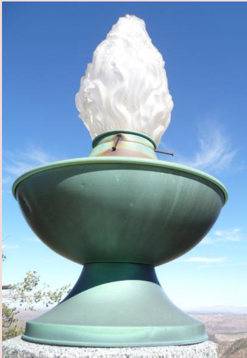
Lamp on top of a pillar

The lamps at the Pillars of God are very unique lighting fixtures. Recently, Gene Barnhurst and I tackled getting these off the tops of the pillars! There are 12 pillars, 10 of which still had fixtures on them and of the 10 only 2 still had the glass lampshades on them (with bullet holes). This is where the story gets interesting. These lamps can be found by a variety of names; Torch Lamps, Empire Torch Lamps, Torchiere lamps, Statue of Liberty Lamps, Flame shaped glass globe and even more. The picture of the glass lampshade and fixture below was taken while the fixture was still on top of the pillar.