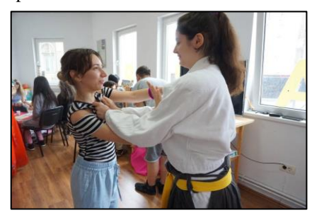
The Self-defence Aikido Area, where one CARP member was teaching the participants about different techniques of protecting themselves without making any enemies.