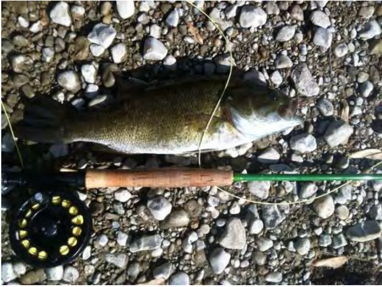
I love smallies, you should have seen the one that got away~JH

Fly Fishers through the ages have allotted great intelligence to fish in general and the harder it is to catch a fish the smarter it must be. However the question remains, "are the fish really smart or are the fishers dumb."