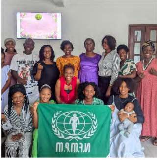
5/23/26 • Administrative Assistant