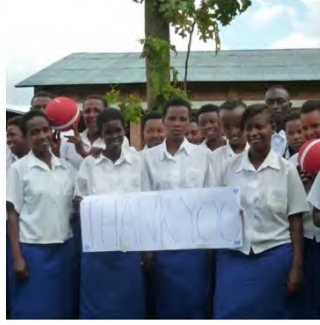
4/23/26 • Administrative Assistant