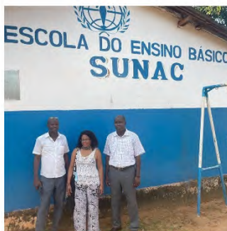
2/24/22 • WFWP USA