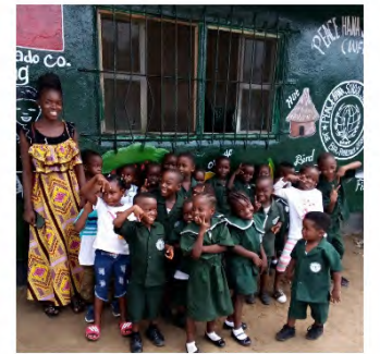
1/31/23 • WFWP USA