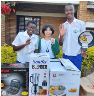
1/13/23 • WFWP USA