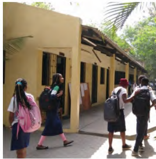
8/11/23 • WFWP USA