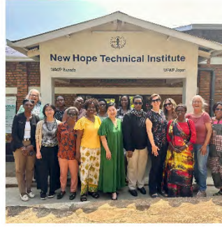
11/19/25 • Administrative Assistant