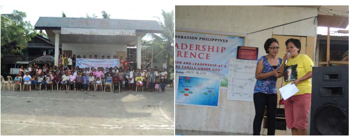
The 4<sup>th</sup> Batch of PLC took also a half-day presentation of God's Original Ideal, Cuase of Human Conflict and the Presentation of the 5 Peace Principles as Resolution of Conflict.

The 135 participants were all parents/beneficiaries of the 4Ps program of the government. The venue is an open court where outsiders who just want to listen the lecture, joined the Toast for Peace and avail the snacks provided.