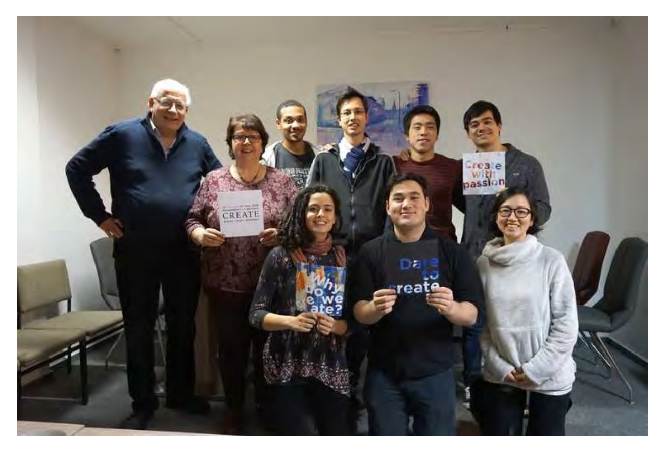
From the 22nd until the 25th of November Unificationist musicians gathered to learn about, discuss and start writing new songs under the motto "Create." Each day had its own sub-theme: