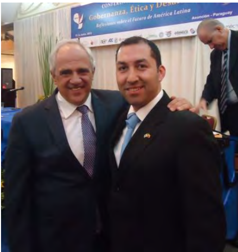
With the Former President of Colombia, Dr. Ernesto Samper Pizano.