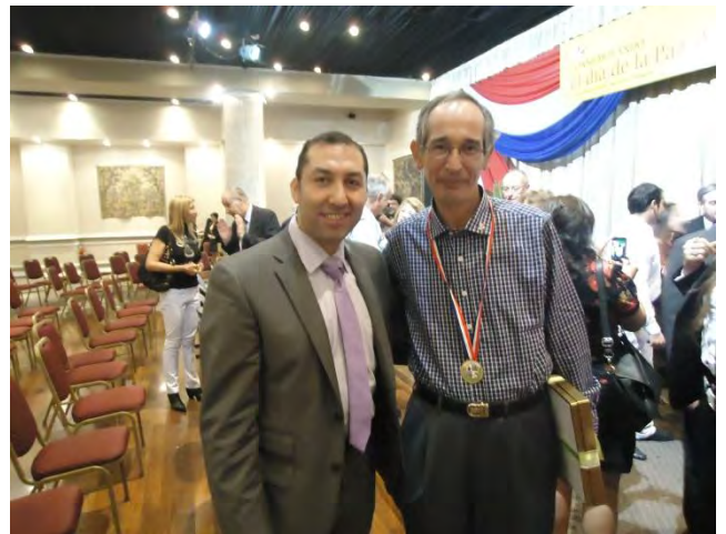
With the Former President of Guatemala, Mr. Álvaro Colón.