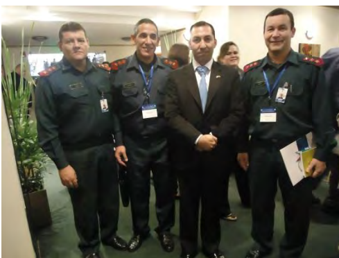
Left: With high officers of the Paraguay Army. Right: with youth political leaders of the National Republican Alliance (also called "The Red Party").