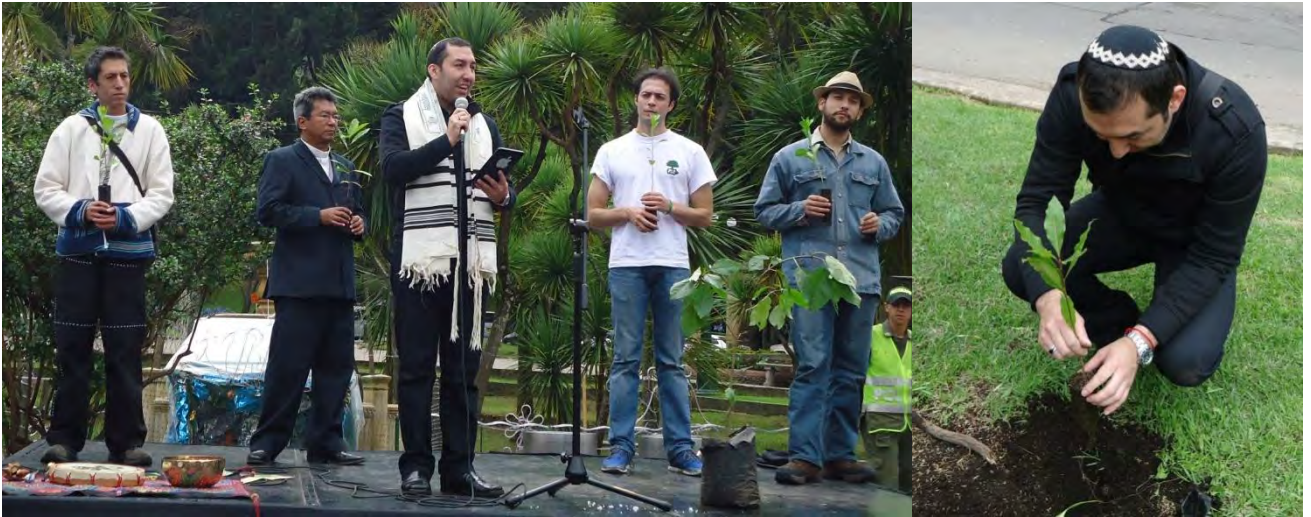
December 2012: The Green Peace Foundation and the leader team of "Sing to Water Colombia" did invite to the Manhíg of Shéggel to participate in an interfaith blessing during the World Day of Trees Sowing, at the National Park in Bogota.