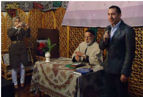
February 2013: Participation in an interfaith forum in the Al-Reza Mosque, on the occasion of the World Interfaith Harmony Week.