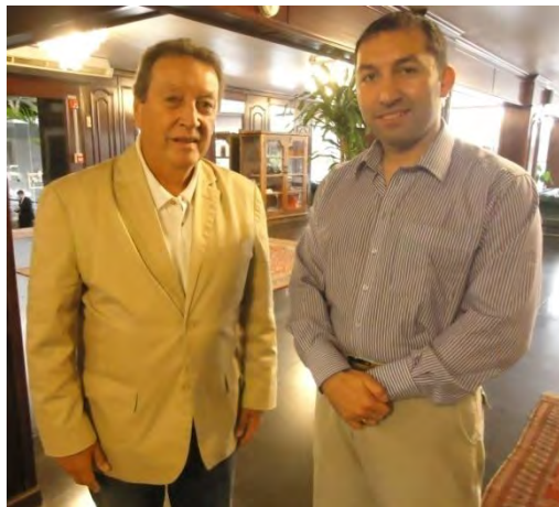
With the Former President of Guatemala, Mr. Vicinio Cerezo.