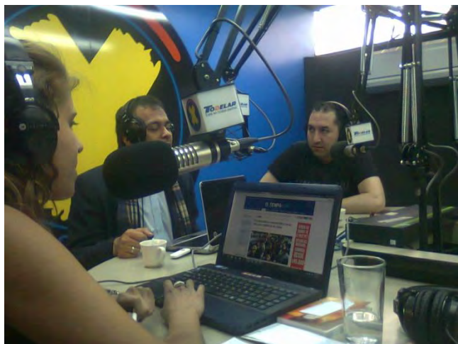
September 2013: The program "Lantern" from Radio Todelar, invited to Manhíg of Shéggel to share with the radio audience an analysis of the importance and challenges to facing with the newly created Colombian Assembly of Religions and Spiritualities.