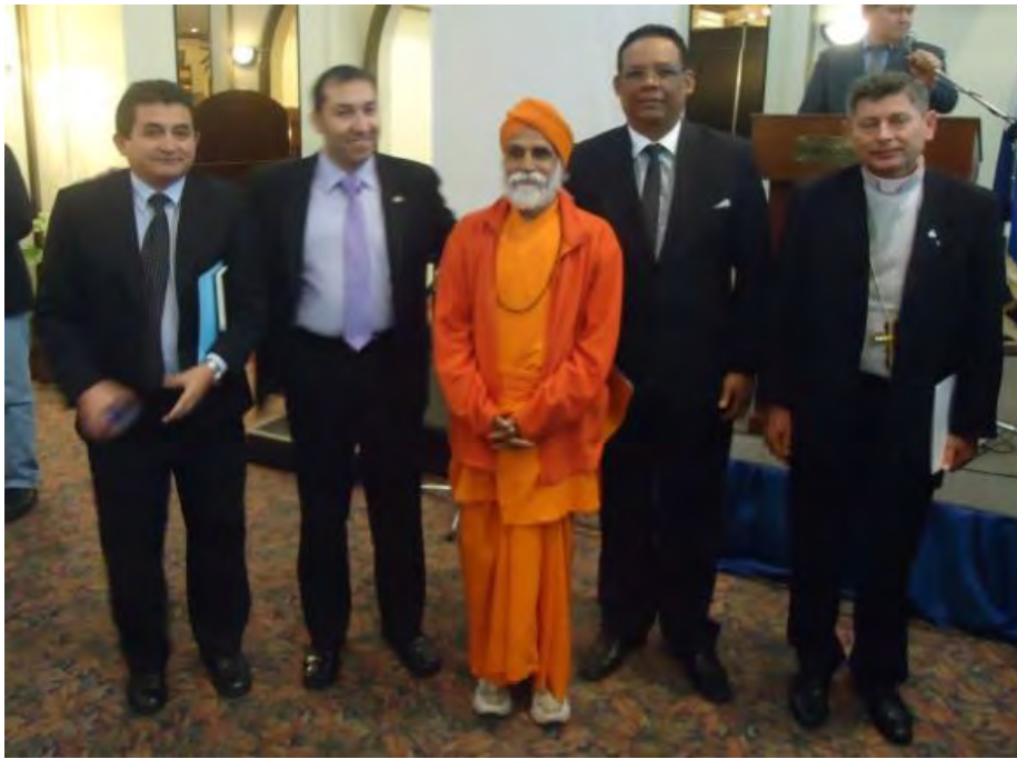
June 2013: Along with religious leaders during an interfaith Conference sponsored by the Ministry of Education and Culture of Paraguay.