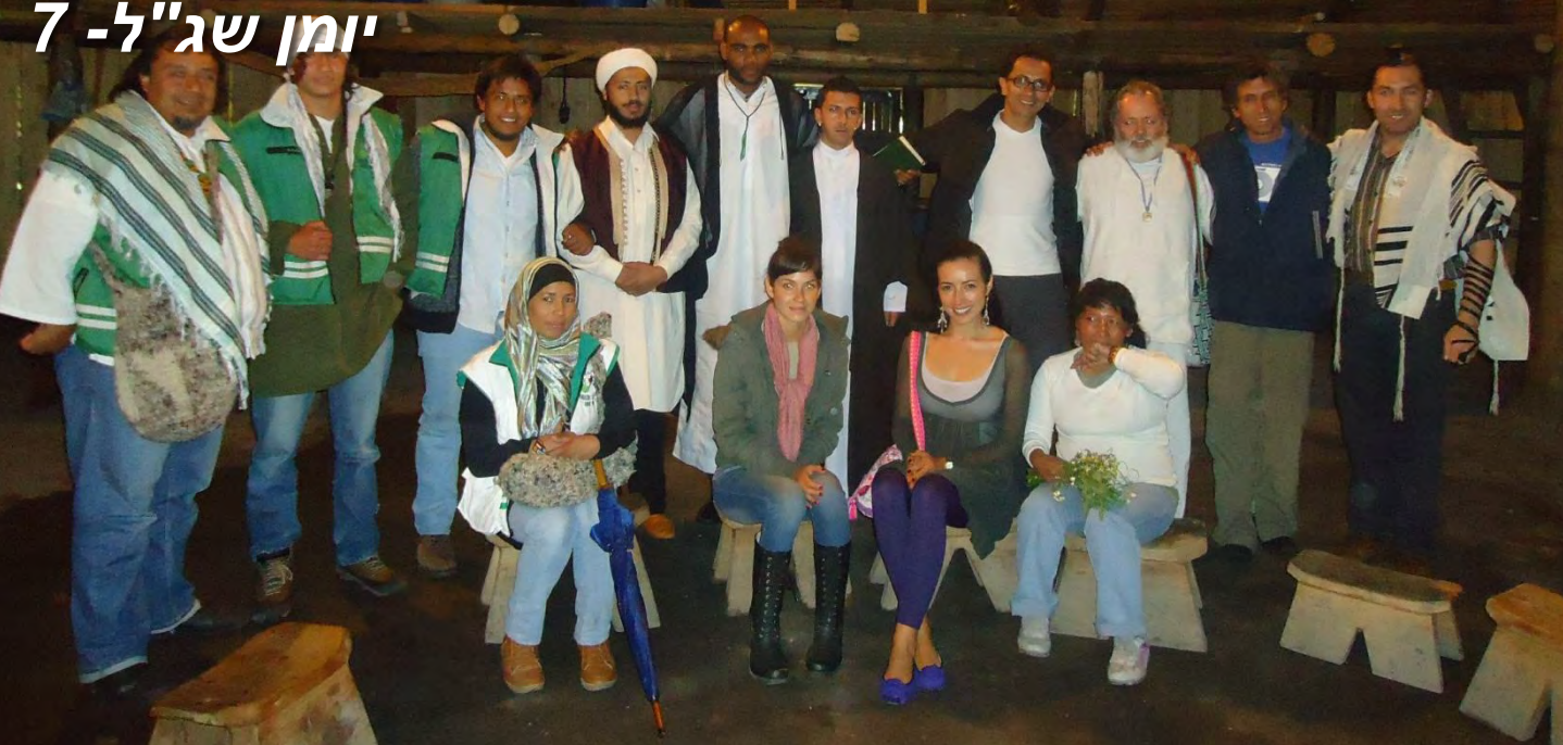
February 2013: The Manhíg of Shéggel did lead in Bogota the opening of the World Interfaith Harmony Week, calling on citizens at the Maloka of the Jose Celestino Mutis Botanic Garden. To the act of sharing sacred invocations attended Native American and Islamic delegations.