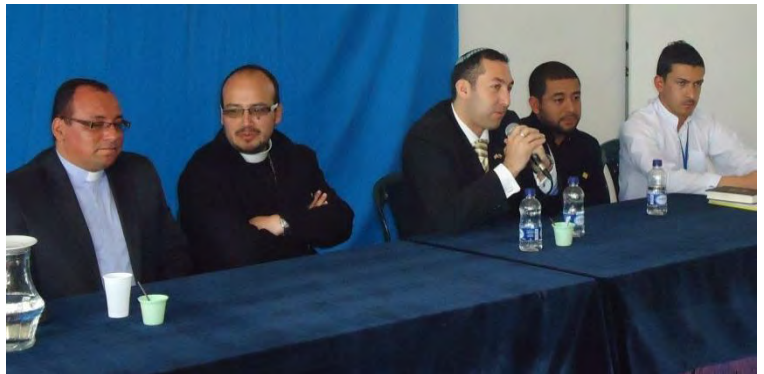
February 2013: Participation in an interfaith forum in CIEDI School, on the occasion of the World Interfaith Harmony Week.