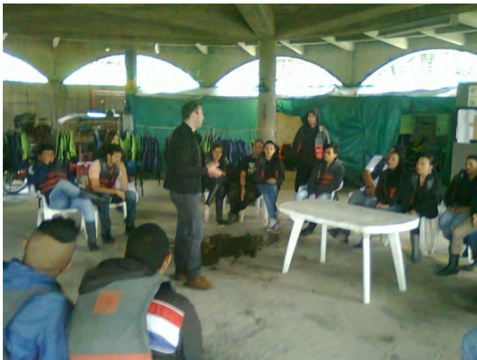
November 2013: Giving a talk on personal growth to the members of District Canoeing League.