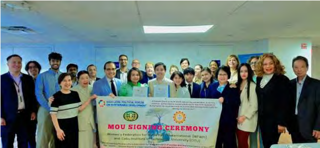
WFWPI Ambassadors for Peace, interns, and friends at the MOU signing event.

They will also trailblaze a global network of 10,000 student leaders who are conscientious, altruistic, and peace-loving environmental stewards led by the WFWPI and CIT-U.