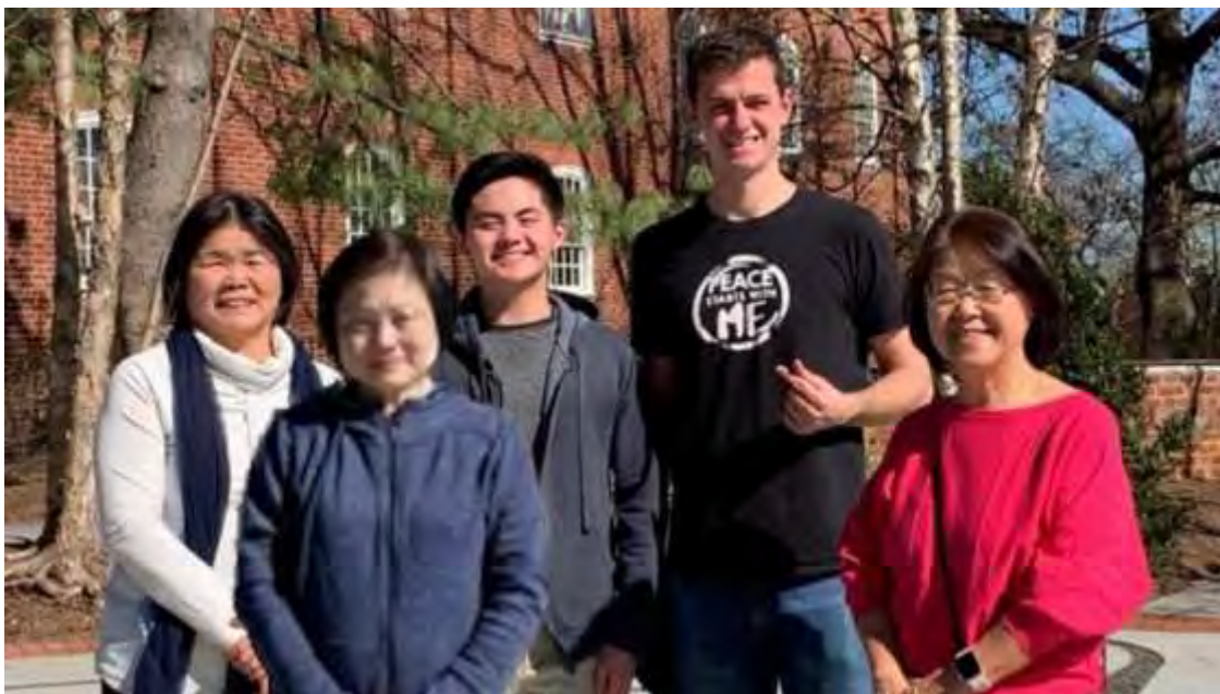
Campus Witnesses gathered to pray at the Holy Ground at the University of Maryland's Memorial Chapel. Join us every Thursday at 12PM!

📷 Send your pictures to robertabendroth7@gmail.com