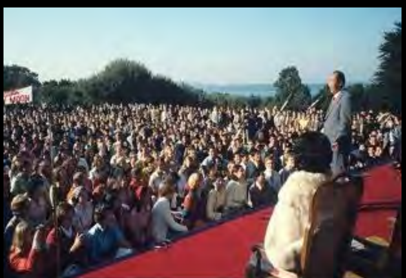
East meets West