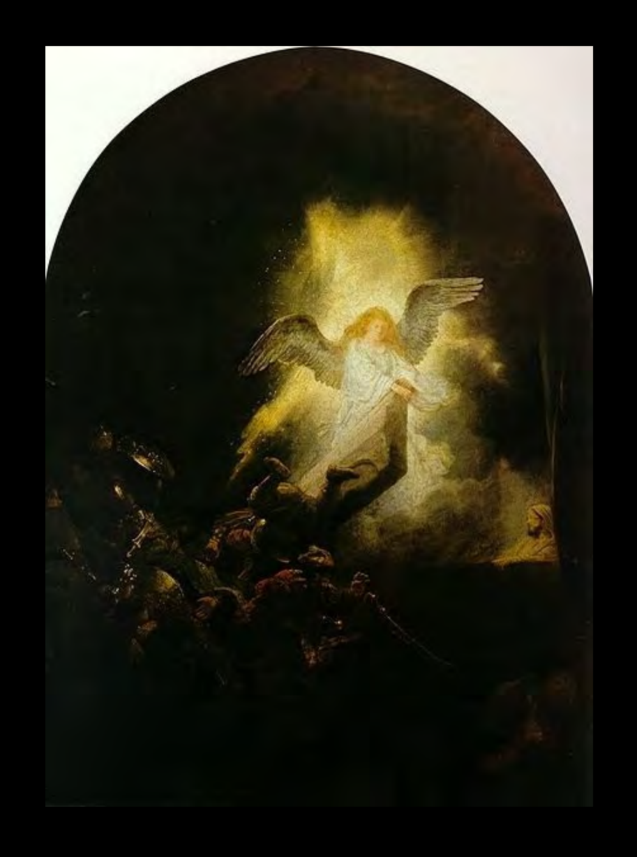
Rembrandt Ressurection 1635/1639