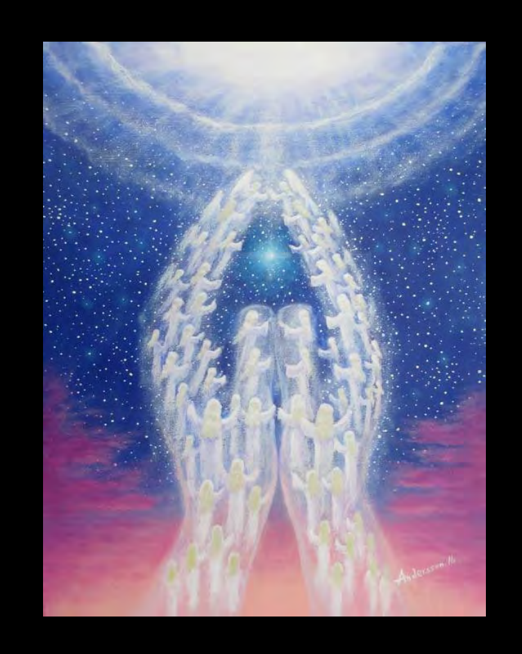
End Please join me in Prayer