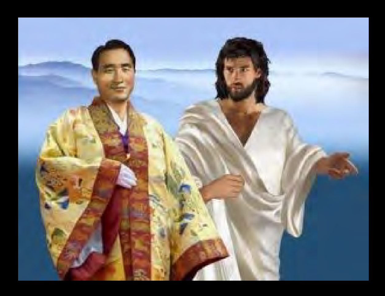
Spiritually inspired painting April 2013