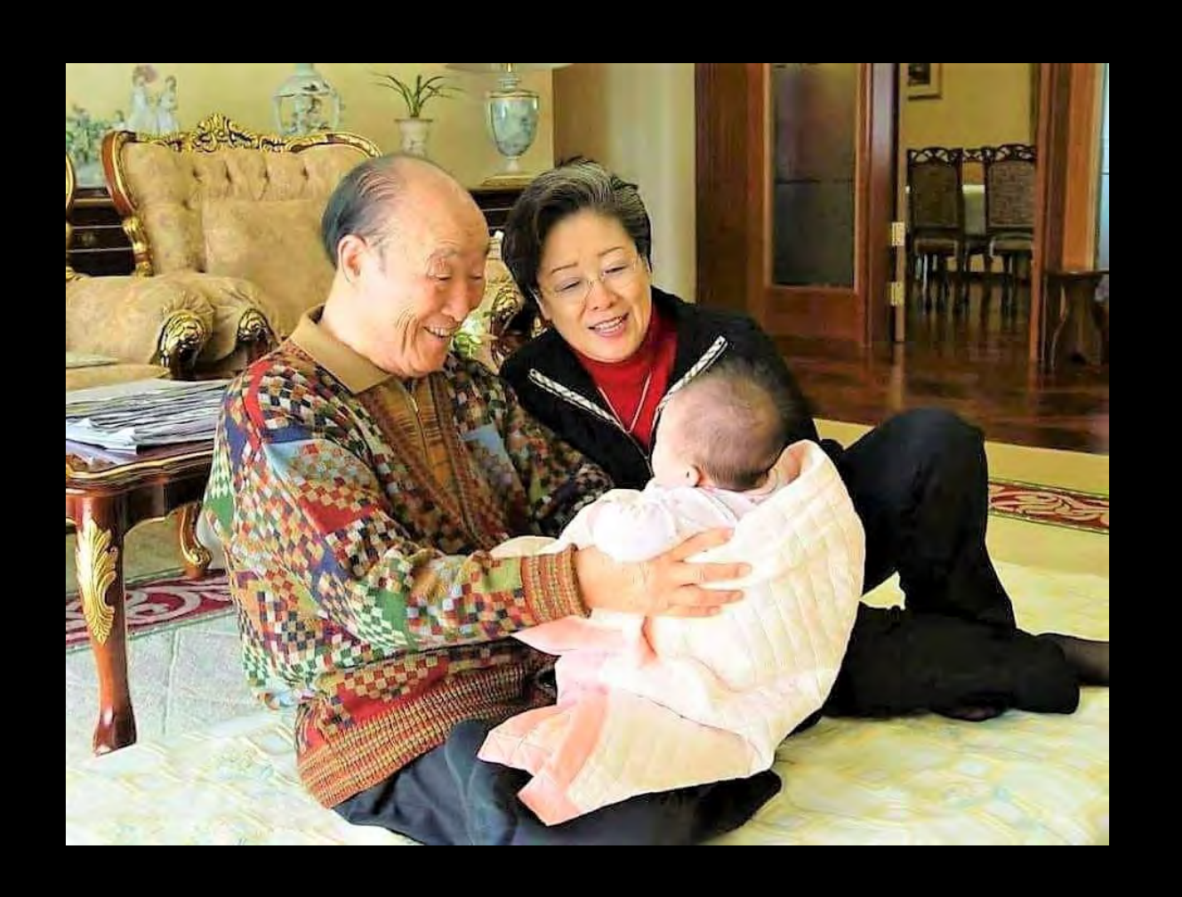
HAPPY DIVINE FAMILY