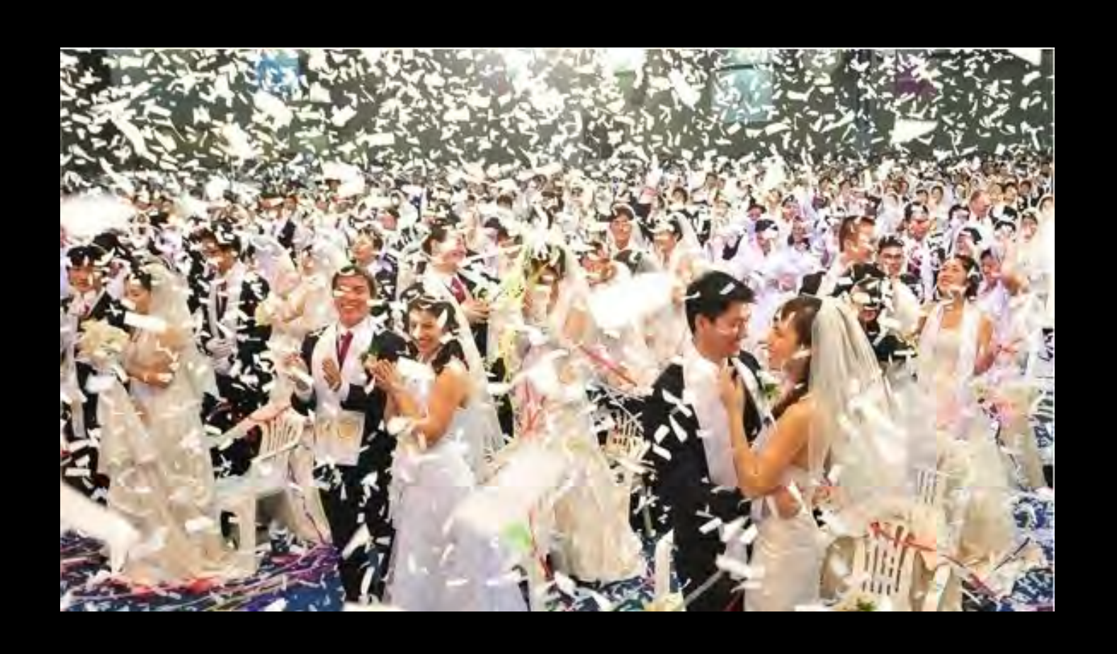
Together – Eternal Happiness!