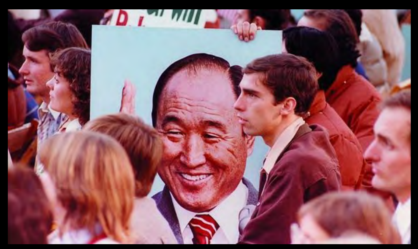
New York 1974