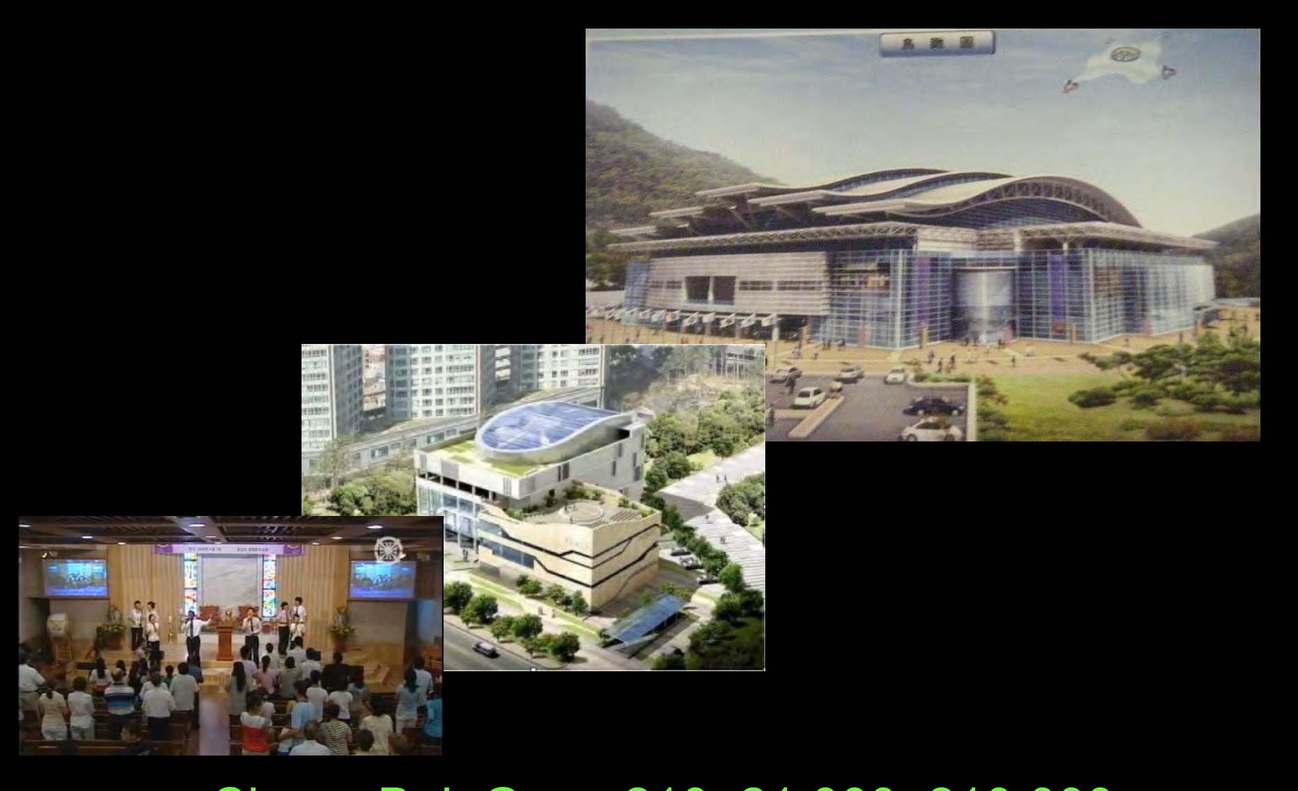
Cheon Buk Gung 210, 21 000, 210 000 Formation-Growth-Completion