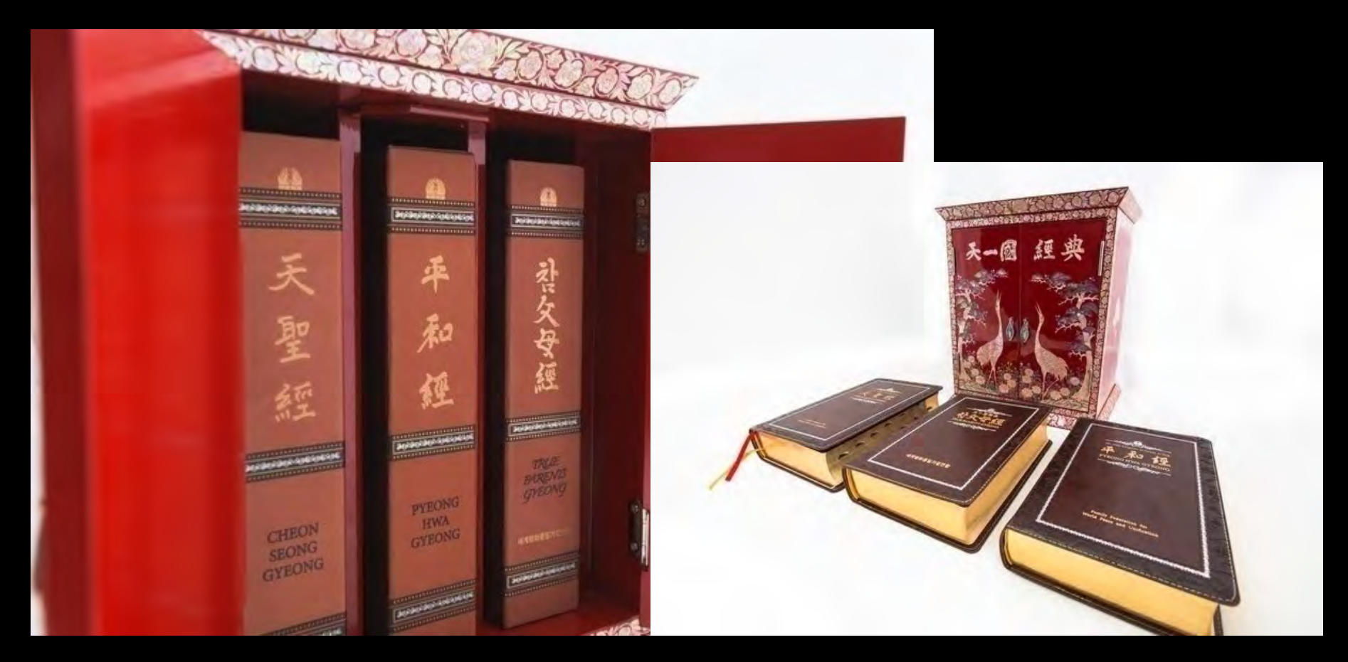
Cheon Seong Gyeong - Pyong Hwa Gyeong - Cham Bumo Gyeong