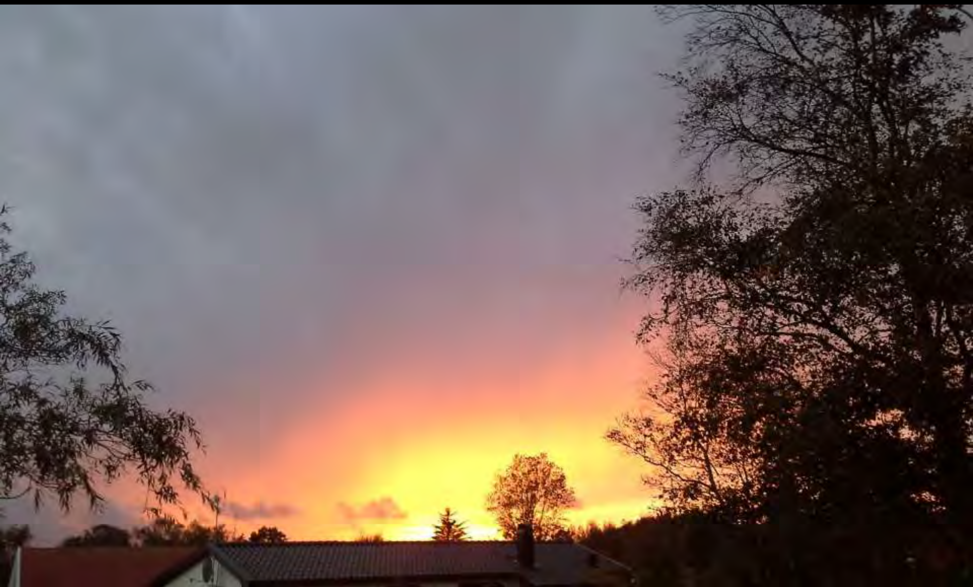
Sweden Late Summer 2015