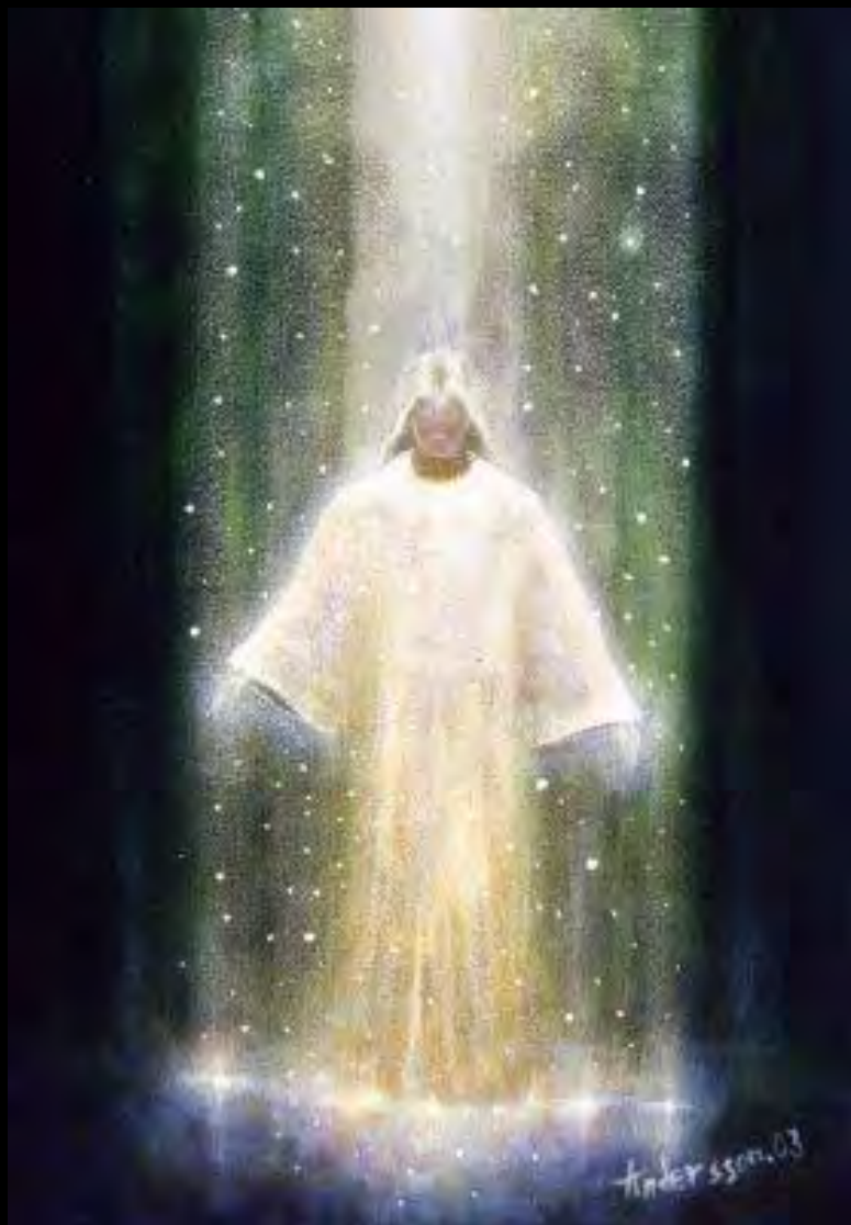
Recense of an Angel Artist Benny Andersson