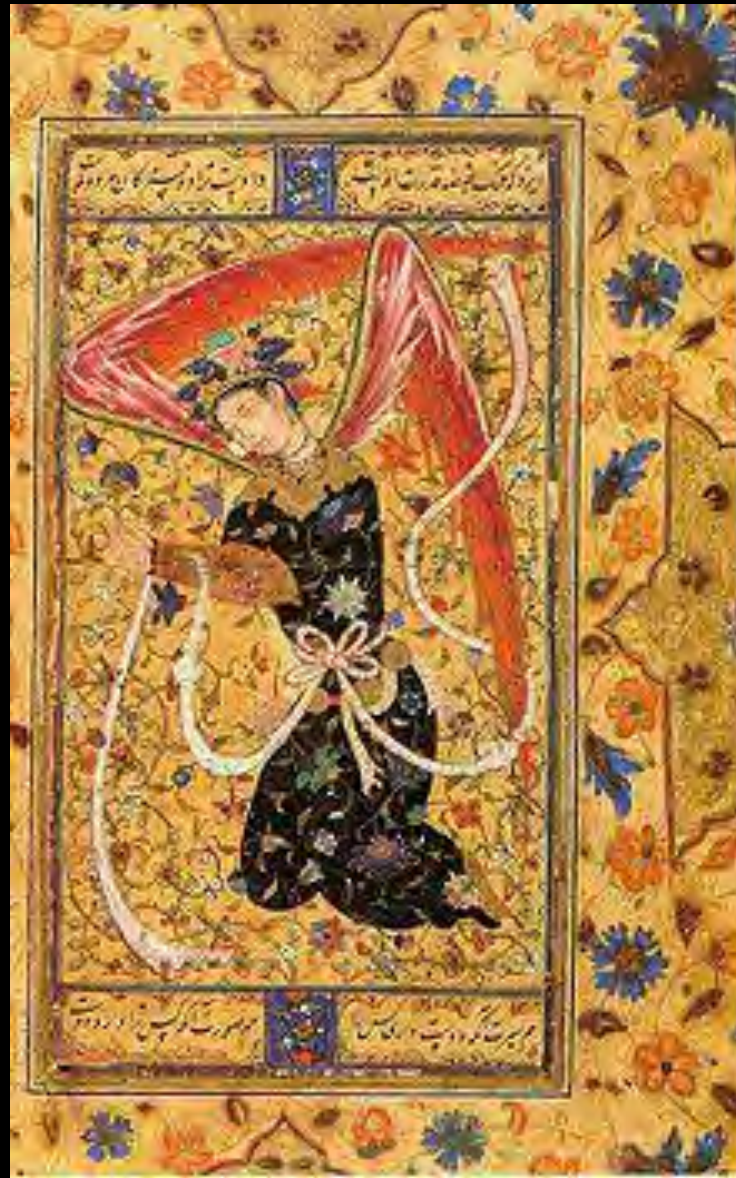
Depiction of an angel in Islamic Persian miniature