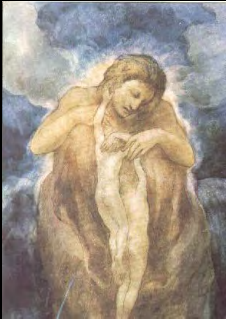
Angel of hope by Kahlil Gibran