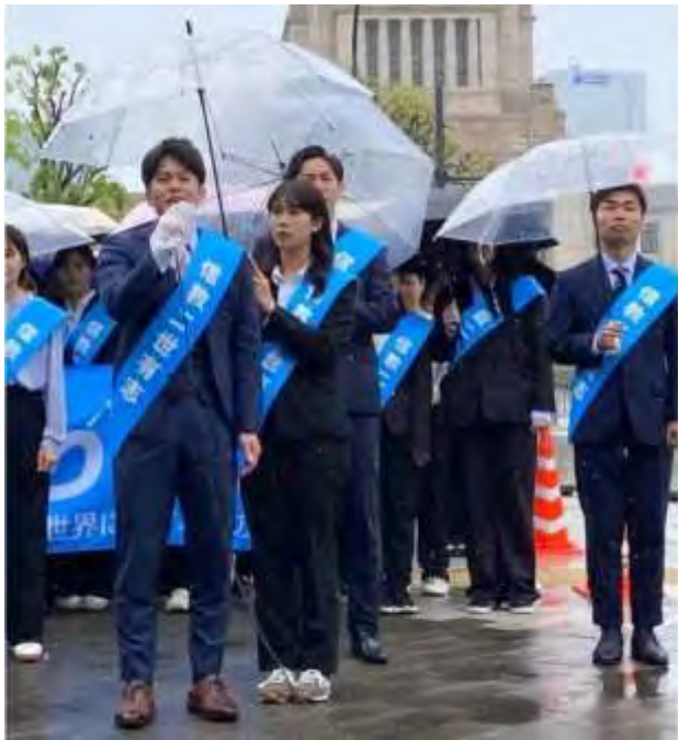
Second-generation members of the Family Federation protesting 6th May 2025 outside the Japanese parliament against the dehumanizing treatment inflicted on them by the authorities in league with militant lawyers

And in some tragic cases, depression and suicide