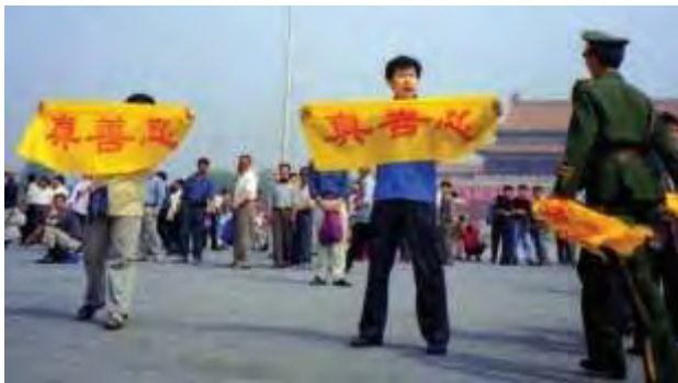
Falun Gong protesters about to be arrested in Tiananmen Square in Beijing in the early phase of the persecution

were shut down under the pretense of "public order". 2 A regulation banning groups that reference a messiah has now passed.