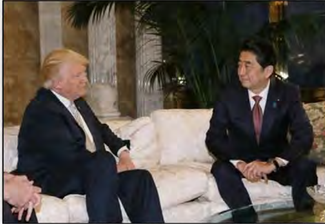
Former Prime Minister Shinzō Abe meeting with then President-elect Donald Trump at Trump Tower, 17th November 2016. Photo: 首相官邸ホームページ / Wikimedia Commons. License: CC Attr 4.0 Int

Abe's greatest legacy was the creation of a new international political framework led by Japan to defend freedom – embodied in the "Free and Open Indo-Pacific" initiative and the Quad (Japan-U.S.-Australia-India strategic dialogue). Today, countries around the world, including Japan, are struggling to cope with U.S. President Trump's aggressive tariff policies. Abe, who earned Trump's trust more than any other world leader, is clearly a global loss. Politicians must learn from Abe's diplomacy and negotiate with Trump with the same sense of scale.