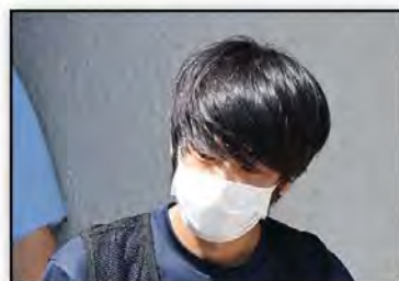
Tetsuya Yamagami, the suspect for the assassination of Shinzo Abe, the former prime minister of Japan.

Initially, when former Prime Minister Abe was shot while campaigning for the Upper House election, politicians and the media harshly condemned it as "a grave challenge to democracy". However, when it emerged that the suspect, Tetsuya Yamagami (山上徹也), was motivated by resentment toward the Unification Church (now known as the Family Federation for World Peace and Unification ), which his mother had joined, media coverage shifted to a more sympathetic tone. The focus turned to the religious organization itself, and the relationships between LDP politicians and the organization came under fire.