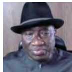
Goodluck Jonathan, President of the Federal Republic of Nigeria (2010-2015)

Congratulations to Dr. Hak Ja Han Moon for this Conference of Hope and thank you for your efforts on behalf of religious freedom and a peaceful world for each and every one of us.