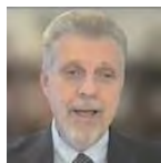
Todd Tiahrt, Former Member of the U.S. House of Representatives

Congratulations to Dr. Hak Ja Han Moon for this Conference of Hope and thank you for your efforts on behalf of religious freedom and a peaceful world for each and every one of us.