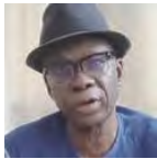
Dr. Beyon Luc Adolphe TIAO Former Prime Minister of Burkina Faso

I would like to take this opportunity to congratulate Dr Moon, UPF and IAPP, on the occasion of the 2nd Conference of Hope. Thank you for the great works that you are doing towards religious freedom. May you be blessed! Thank you very much.