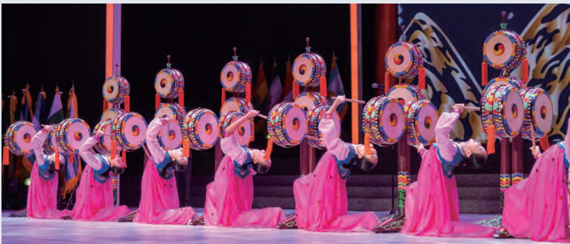
International Association of Arts and Culture for Peace (3rd Rally of Hope)