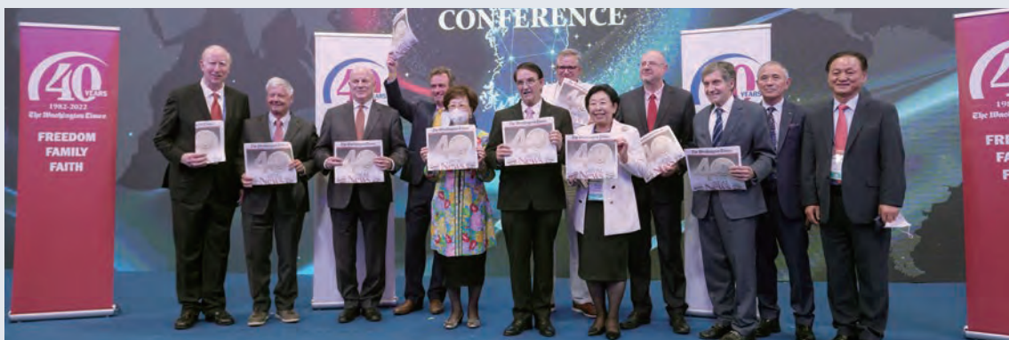
Washington Times 40th Anniversary Ceremony (Jamsil Lotte Hotel)

On February 2–3, 2020, an International Media Association for Peace Assembly was held at the Jamsil Lotte World Hotel in Seoul, including talks on The Role and Mission of Journalists for Peace on the Korean Peninsula and other current media issues. The founding declaration for the association stated, "IMAP recognizes the vital role that journalists play in guarding against totalitarianism and supporting the expansion of freedom. IMAP represents a worldwide professional network of journalists who support a socially responsible and moral media to convey accurate content, address the challenges of our time based on the highest principles of ethical journalism, and understanding that universal values are key elements of a world of peace."