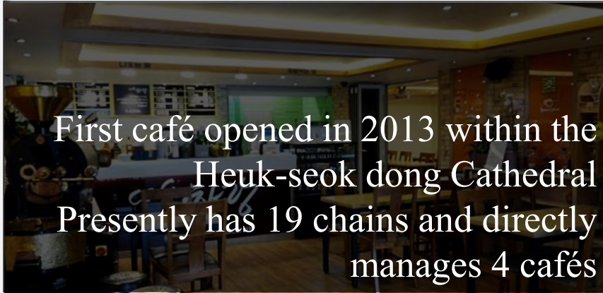
First café opened in 2013 within the Heuk-seok dong Cathedral Presently has 19 chains and directly manages 4 cafés