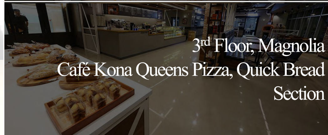
3 rd Floor, Magnolia Café Kona Queens Pizza, Quick Bread Section