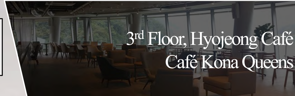
3 rd Floor, Hyojeong Café Café Kona Queens