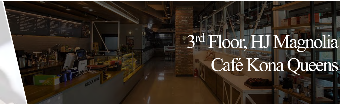
3 rd Floor, HJ Magnolia Café Kona Queens

Many experienced baristas in Cheonwon complex