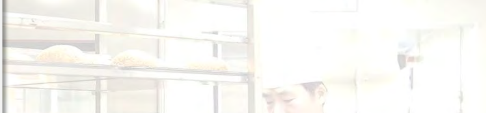
Hyojeong Bakery 2 master craftsmen in confectionery & baking 2 craftsmen in confectionery & baking