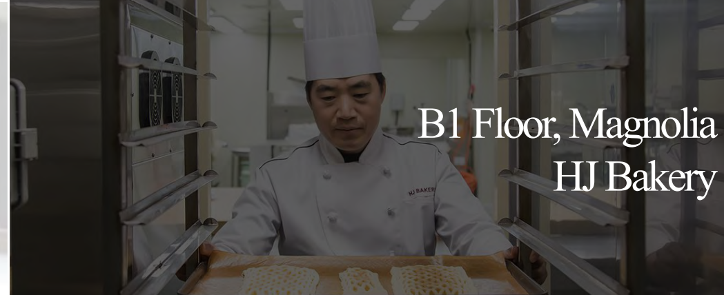
B1 Floor, Magnolia HJ Bakery