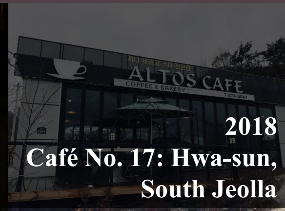
2018 Café No. 17: Hwa-sun, South Jeolla