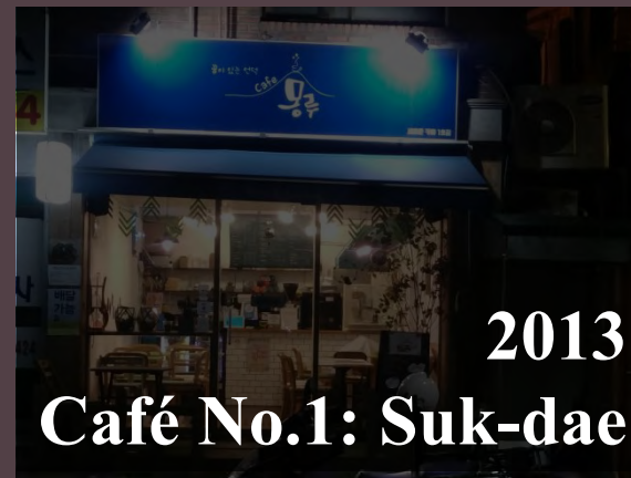
2013 Café No.1: Suk-dae