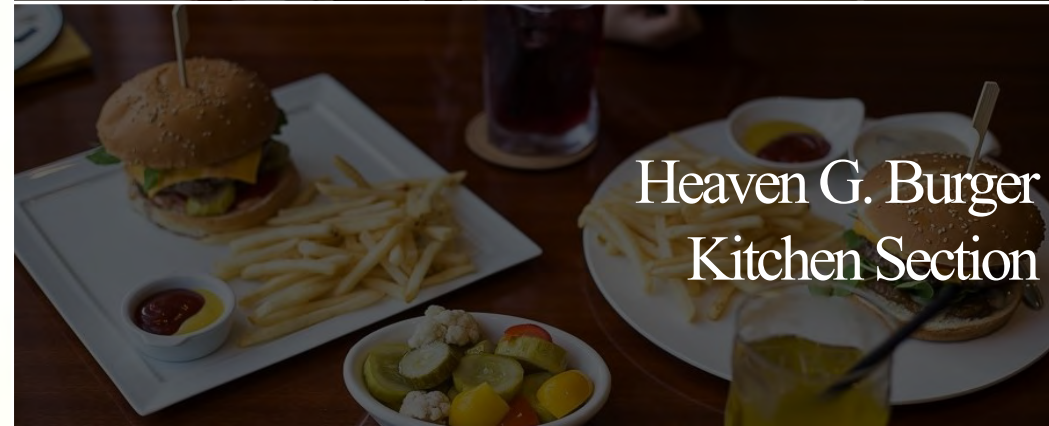
Heaven G. Burger Kitchen Section