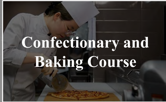
Confectionary and Baking Course