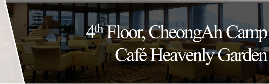
4 th Floor, CheongAh Camp Café Heavenly Garden