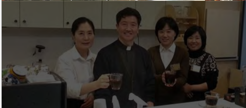
Operates a barista certification course