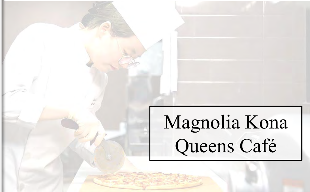
Magnolia Kona Queens Café