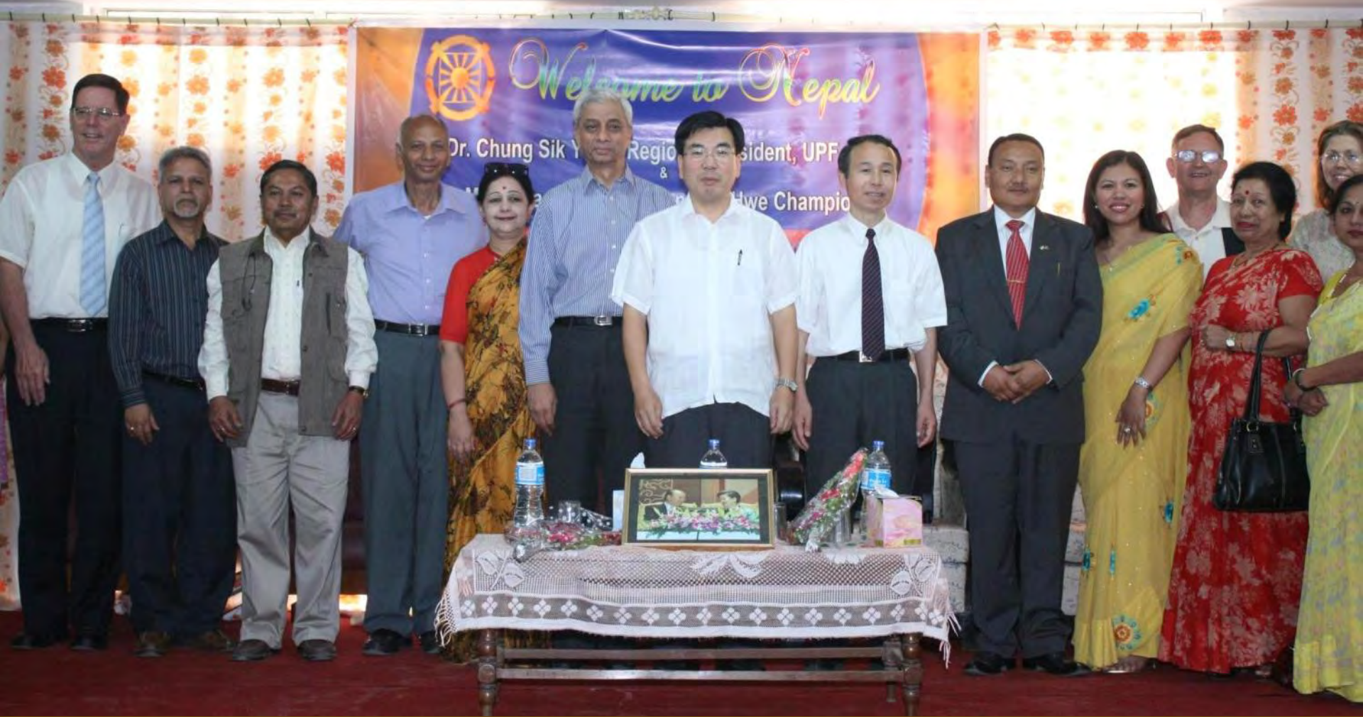
Ambassadors for Peace who attended HDH culture seminar.