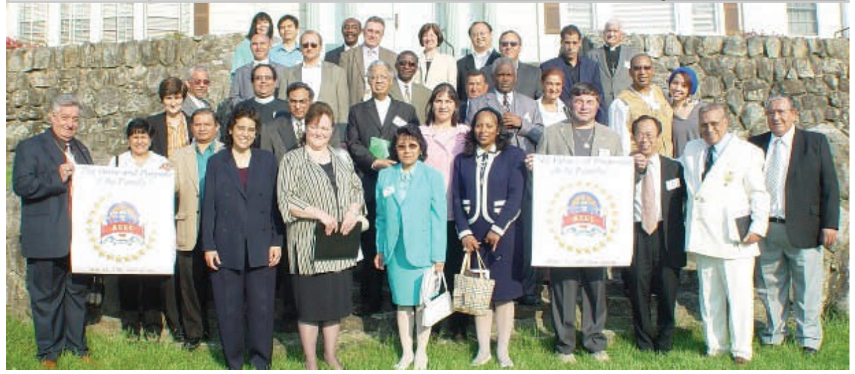
All participants of the ACLC National Hispanic Clergy Conference at Carmel Retreat Center in Mahwah, NJ.

he conference setting of the first Spanish-American ACLC conference was beautiful: