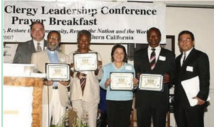
New ACLC members received certification

It was a prayer breakfast in which we could truly feel both the masculine and feminine aspects of God. The April 28th ACLC monthly prayer breakfast in Los Angeles took place in the Christian Light Missionary Baptist Church. More than 100 participants were present in the ACLC program.