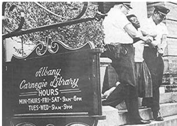
Young woman arrested for entering a Whites-Only public library in 1962.

However, Unificationists can learn more from Dr. King as to how to channel that love and peace into action. In other words, Unificationists can act upon what they already know about peace and love. Unificationists can learn from Dr. King on how to demonstrate love more confidently and more openly.