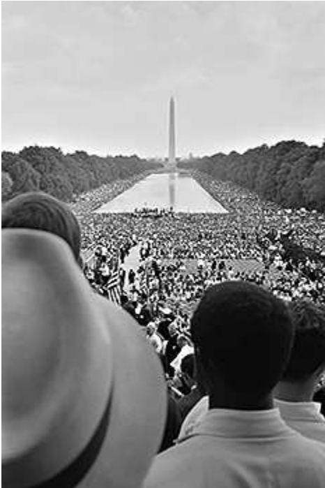
Crowds surrounding the Reflecting Pool, during the 1963 March on Washington