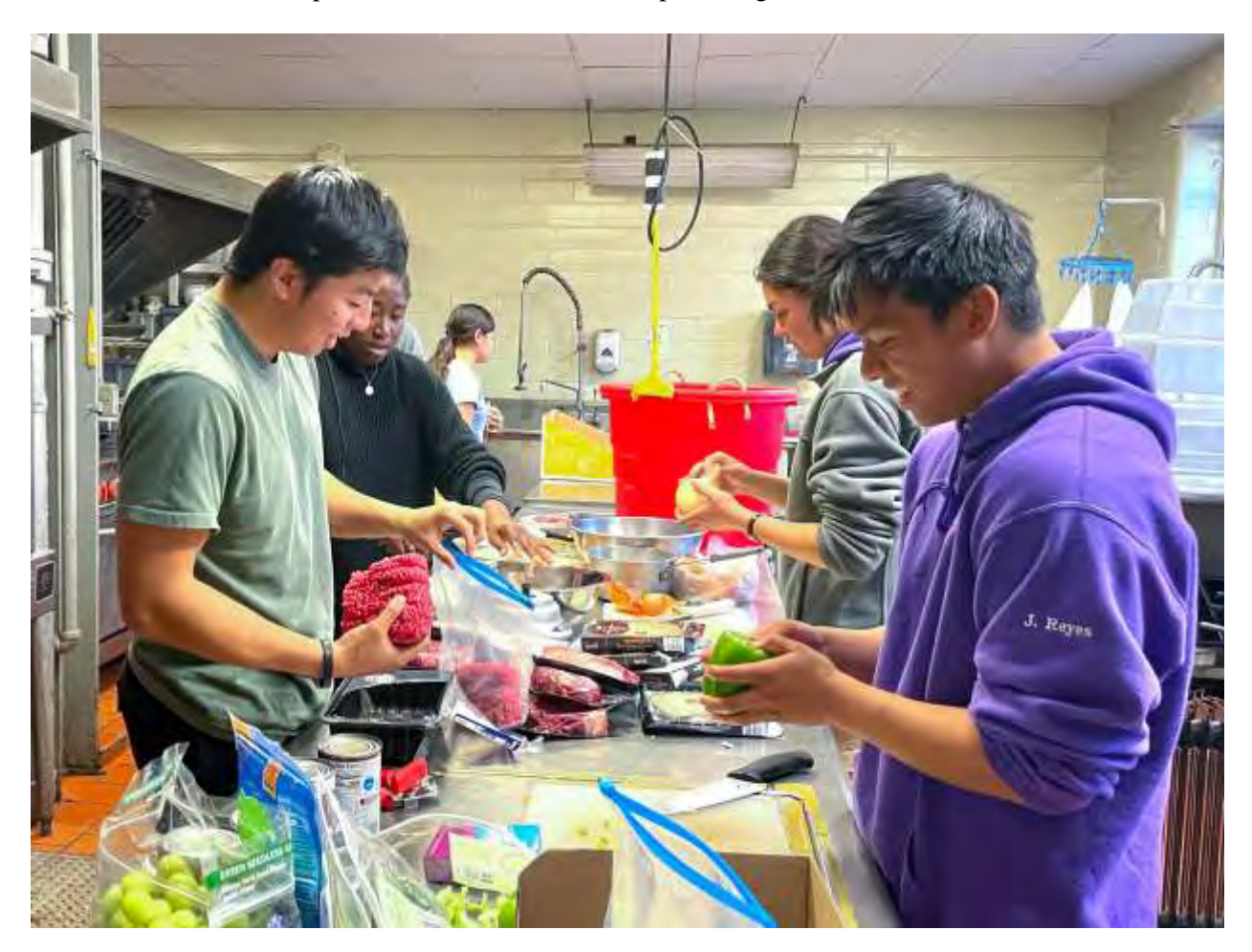
As we were preparing everything, we were later informed that we had to wait another day due to the warm weather melting the lake we needed to hike across. Of course, many of us were excited to leave as soon as possible, but because of this extra day, we had more time to prepare ourselves fully. Yes, preparing all the external things we need to go adventuring, but we also need to prepare our hearts to have the right intention and attitude to have the best experience out there.

On the bright and beautiful morning of the 15th, waking up from our night in the woods, many were able to get a good rest. We have one more day left at UTS before heading out to the Adirondacks! With that in mind, we all packed our bags and headed back to the UTS building. Later that morning, we learned about prepping our hiking bags and took time to prepare everything we needed for our week-long journey. A little before noon, we headed out as teams to buy our meals for the next eight days out in the woods! Everyone was very excited, and we all rushed inside the stores to get everything we planned to make and eat. When we returned, we all brought our groceries inside and prepared them to take with us; we cut certain food into smaller pieces, transferred food into Ziplock bags, etc.