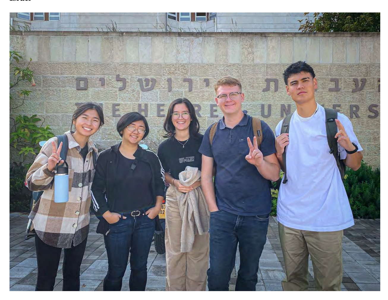
For CIG missionaries in Israel, the team has been working closely with the local CARP, YSP, and UPF chapters. Together, the three groups have hosted cultural activities, game nights, and lectures sharing about Unification values and principles. "Our team had the opportunity to follow the path that Jesus