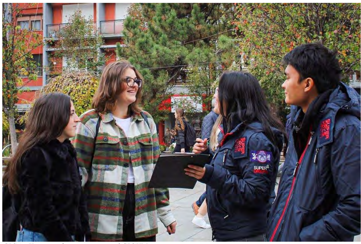
CIG in Kosovo

It's been an eventful month for six U.S. teams of Cheon II Guk Youth Missionaries (<u>CIGYM</u>) who departed in November for their mission countries of Zambia, Romania, Kosovo, Israel, Peru, and the Dominican Republic. Find out how each team has adjusted to life abroad as they share their Unification faith with their new communities over the next several months.