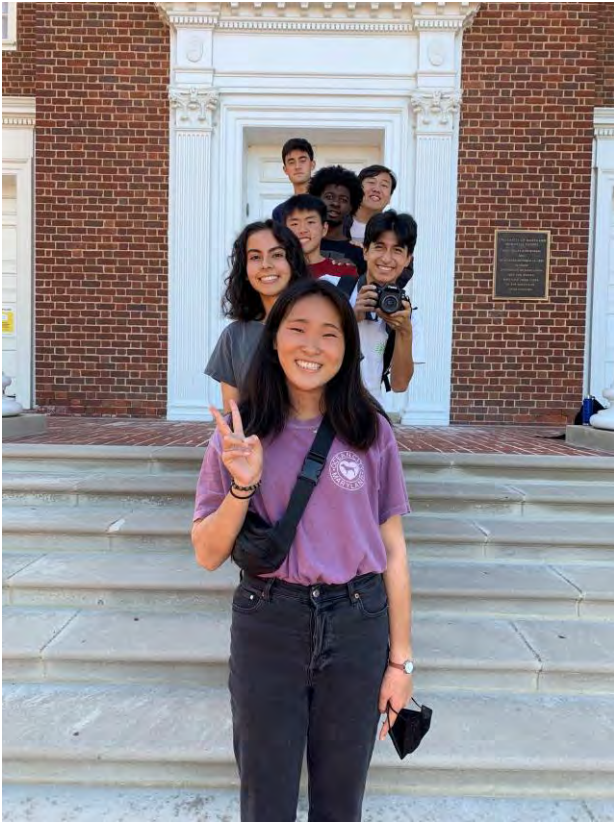
DMV Missionaries (Washington DC, Maryland and Virginia)

In the coming weeks we'll dive deeper into the experience at each of the CARP centers across the United States. Highlights of each team's experience will be shared alongside the challenges and growth in realizing the dream of God and our founders, Father and Mother Moon.