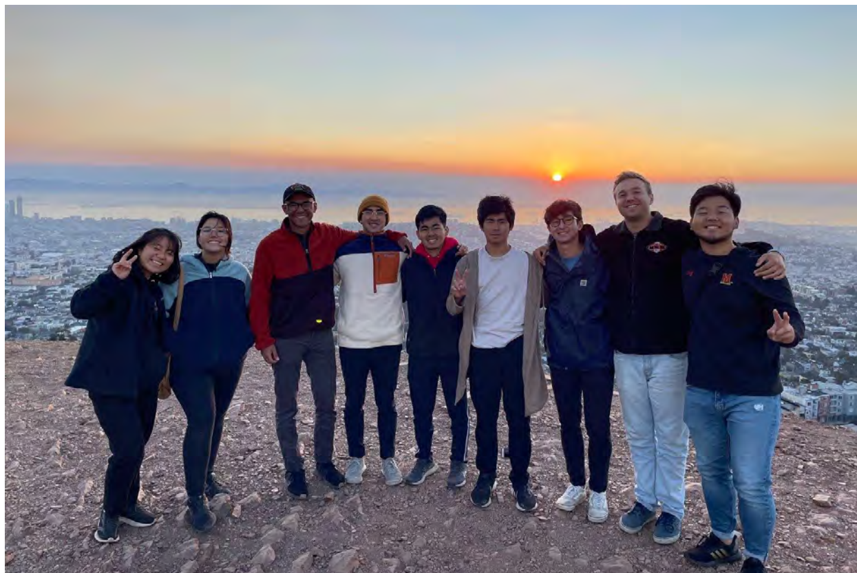
Bay Area missionaries

The recent change of seasons brought a big change in training for the CIG missionaries. After wrapping up our joint workshop with Generation Peace Academy (GPA) in Barrytown, NY to kick off this fall semester, our twenty-eight missionaries shifted gears at the advent of their next mission, witnessing across the United States on college campuses. With burgundy leaves of a New York autumn behind them, the CIG missionaries split into five teams over four cities and spent a week traveling and preparing to step onto school grounds equipped with God's truth and love. It has been two weeks already and the collective efforts have made an impact far beyond that small span of time.