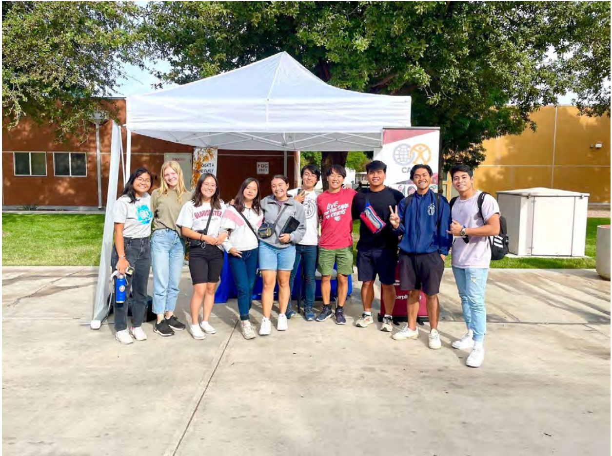
Las Vegas Missionaries