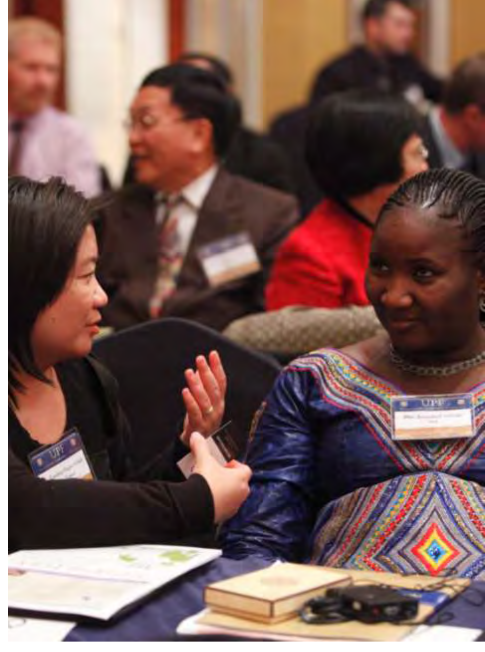
Give and take among conference participants