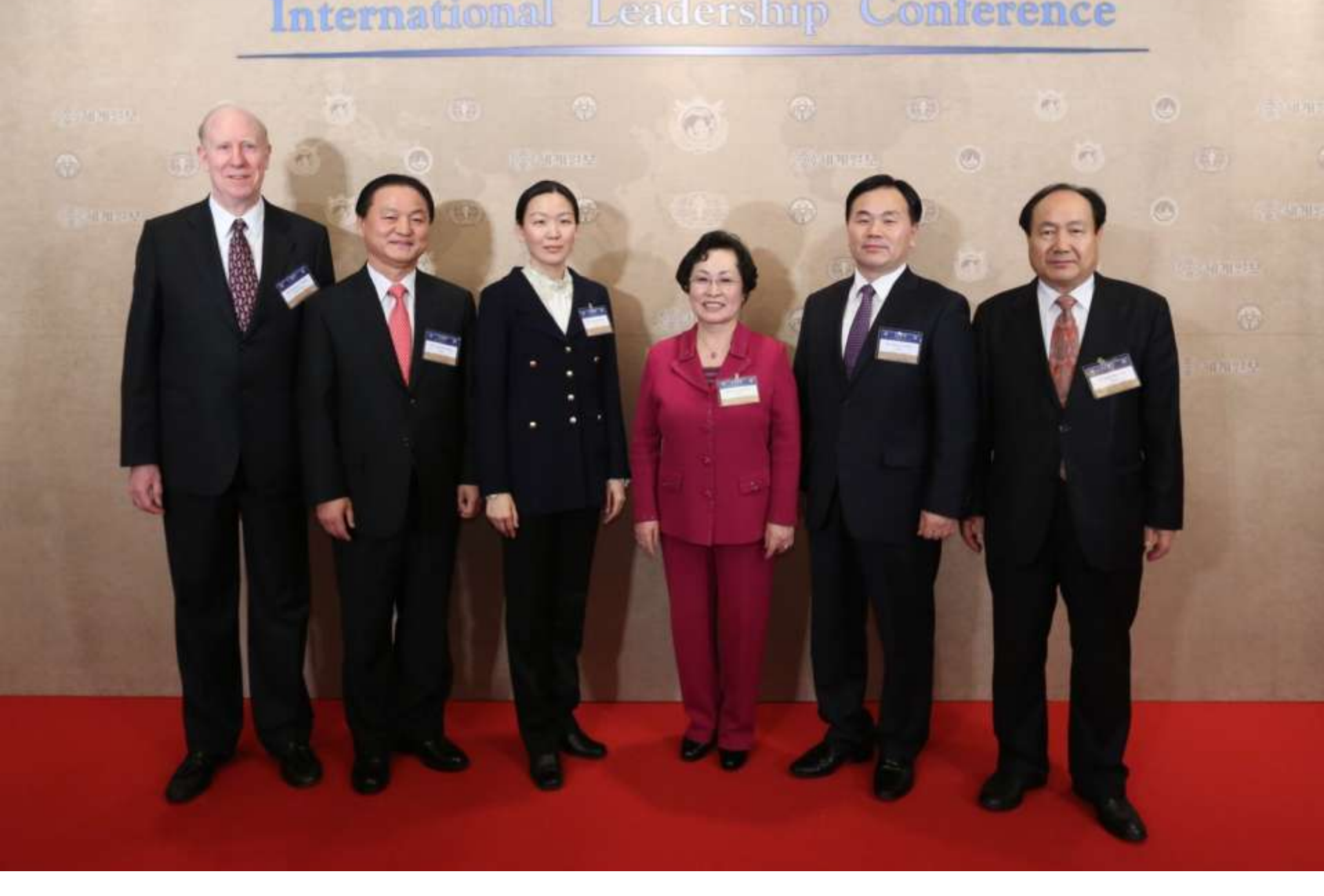
Preparing to welcome participants from 60 nations to the opening banquet