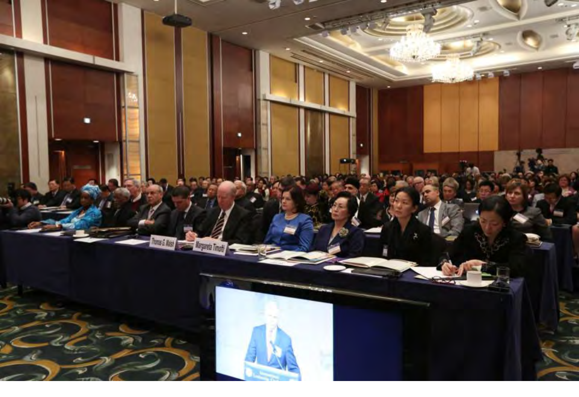
The distinguished speakers attracted an audience of about 400 people.