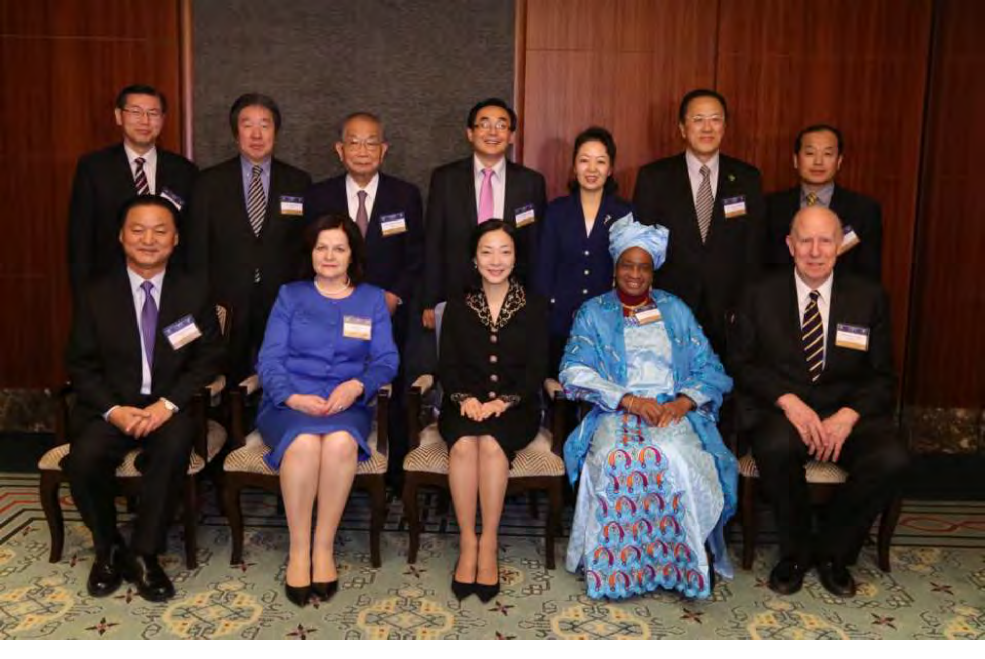
Keynote speakers and organizers prepare the opening session on "A New Paradigm for Peace and Human Development."