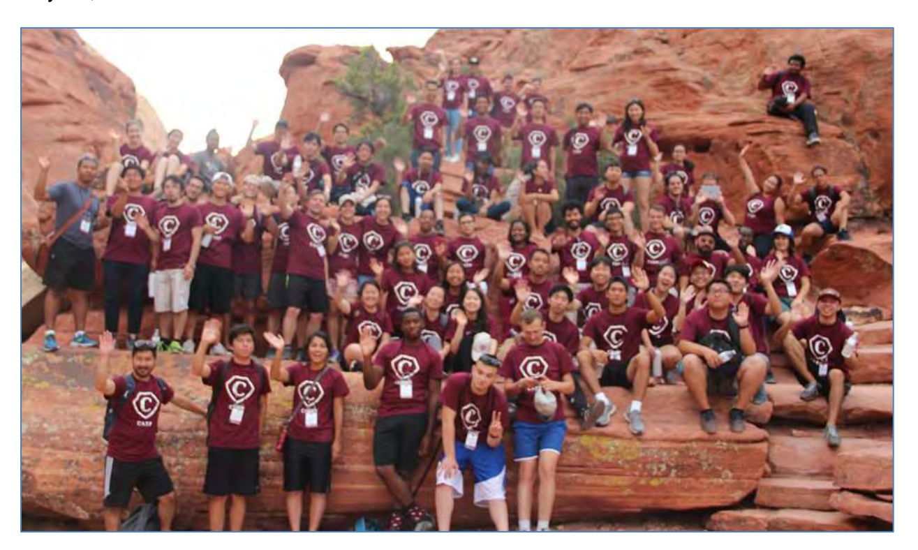
CARP America hosted its 'Global Momentum' conference from July 27-31 at the International Peace Education Center in Las Vegas. Over 120 participants gathered from the United States, Austria, Canada, Costa Rica, England, Japan, Korea, Russia, South Africa, and Switzerland.

There was an incredible spirit, energy, and excitement from being together with such a diverse and uplifting group. Students, young professionals who serve as CARP mentors, and CARP leaders joined the five-day workshop, and National Youth Ministry also collaborated on several sessions together. The celebrations culminated in CARP's 50th anniversary banquet over the weekend, bringing almost 300 participants including alumni, family, friends, and loved ones.