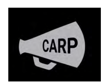
Mentoring Students and college graduates get connected in supporting each other. If you'd like to be a student or mentor, IOIN HERE!