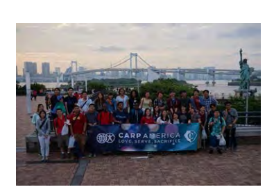
Read the reports of the exciting activities

36 CARP members from around the US are currently in Japan to develop global bonds and inherit the foundation of CARP in Japan. This is a ground-breaking initiative, started by the local CARP Los Angeles chapter that quickly grew... read more here!